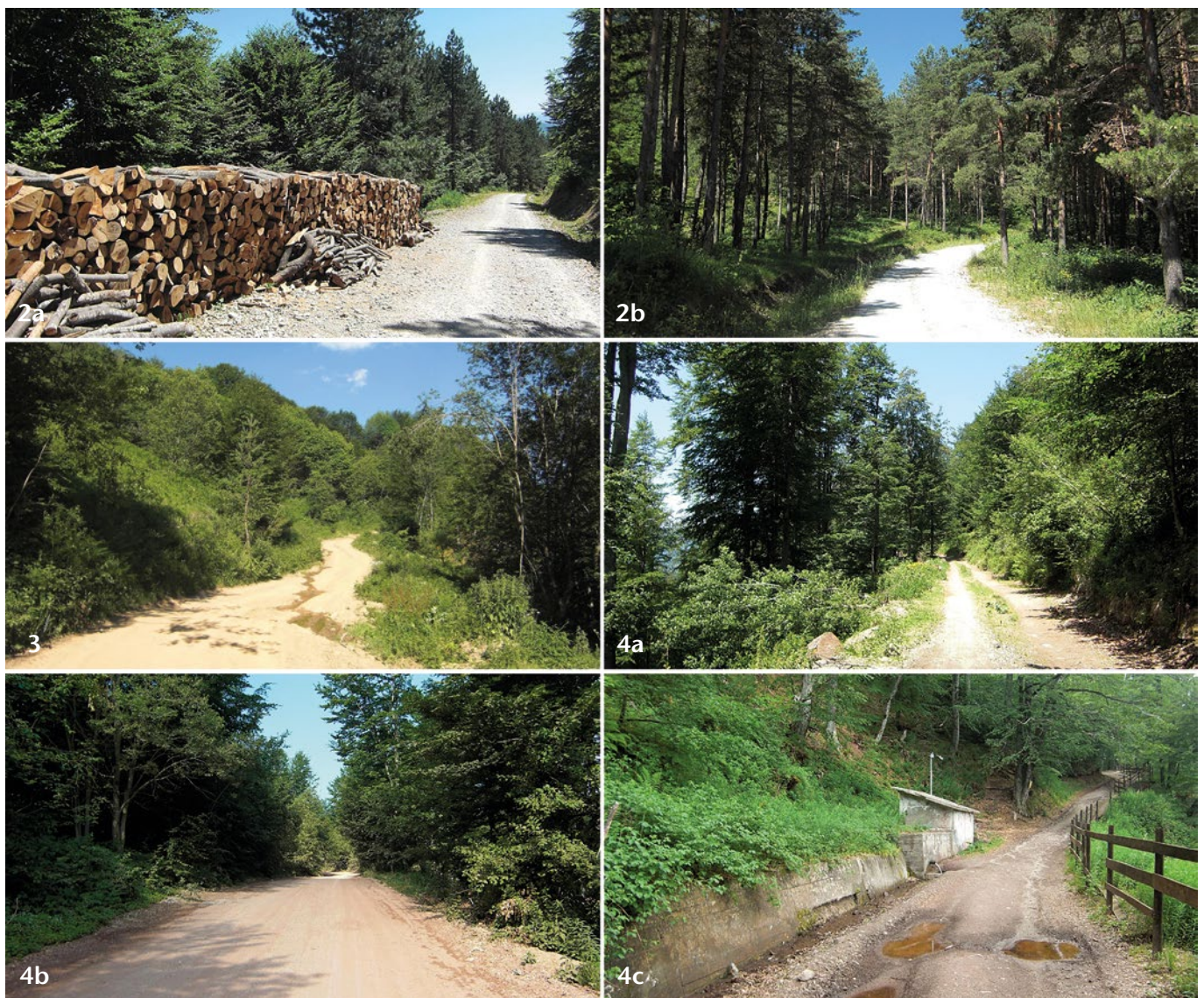
Plate 1, Figs. 2–4: Localities of N. vauualbum in Serbia. Figs. 2a–2b: Mt. Mučanj, Moravica, 19. vi. 2012. Fig. 3: Golija Biosphere Reserve, Moravica, 20. vi. 2012. Figs. 4a–4c: Babin Zub, Stara Planina, 23.–28. vi. 2012 — Photographs: MGP.

Between 22. vi. and 30. vi., various habitats in the Stara Planina region were surveyed (Figs. 4a–c). On 25. vi. a fresh specimen was observed flying along a woodland ride north of Janja at an altitude of 590 m. It was flitting between damp patches where other nymphalids were congregating, including: Argynnis paphia (LINNAEUS, 1758), Apatura ilia ([DENIS & SCHIFFERMÜLLER], 1775), Apatura