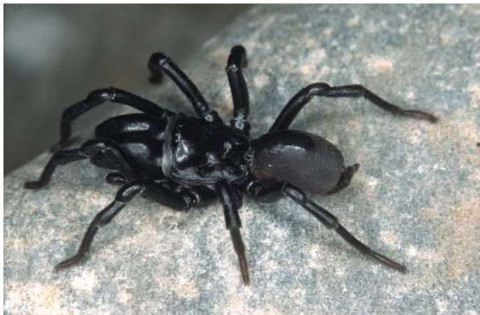
Figure 25: A surprising inneralpine presence of Atypus piceus in the Gesäuse National Park.

Due to their consistent dynamic nature, avalanche tracks and similar erosion areas are among the very few sites in Central European landscapes that offer permanent treeless or even vegetationless habitats. These important extreme environments offer a wide spectrum of mosaic-like habitat-structures and microclimatic conditions, especially rocky areas and deadwood. They are considered to be primary refuges for several thermophilic and heliophilous species, from which they can disperse into the surrounding cultural landscape. Therefore they play a major role in the survival of rare and endangered arthropod species and coenoses and are important refuges of endemic species. As a hot-spot of biodiversity they are deserving of protection.