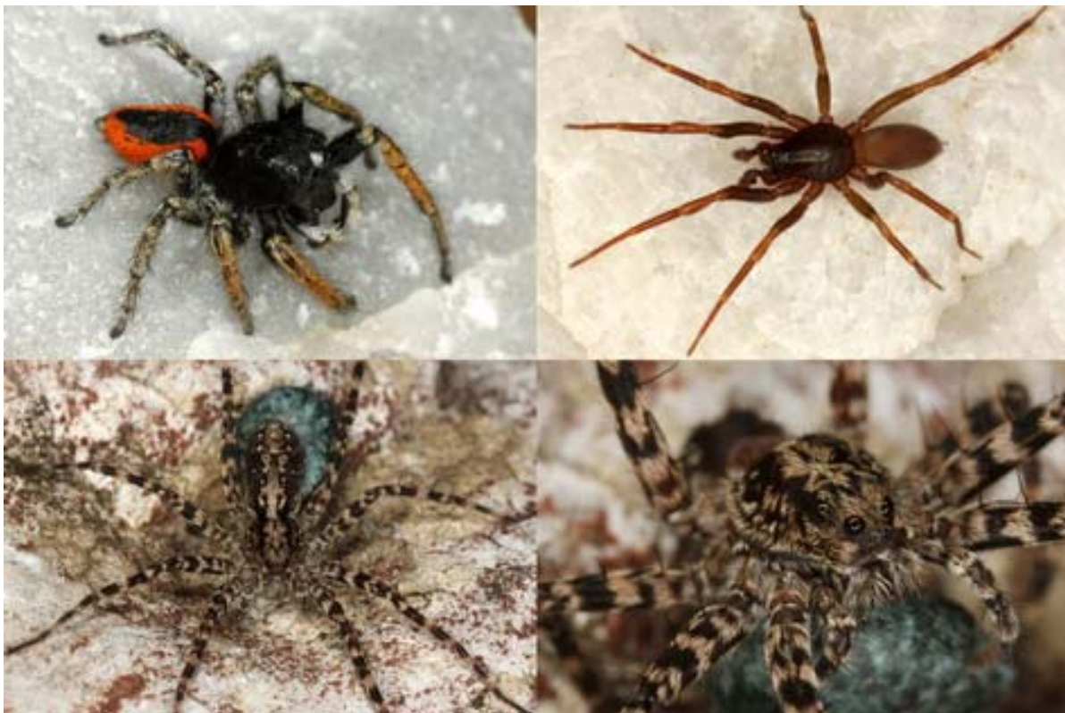
Figures 16-19: Spiders (Araneae) of avalanche tracks in the Gesäuse: Philaeus chrysops . Harpactea lepida . Acantholycosa lignaria (2x).