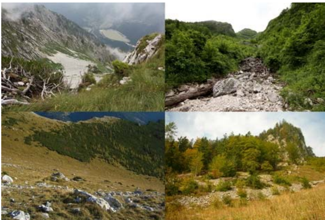
Figures 5-8: Investigated avalanche tracks in the Gesäuse National Park: Tamischbachturm. Kalktal. Lugauerplan. Kalktal.

The investigation area is the Gesäuse National Park in the Northern Calcareous Alps, Styria, Austria. The vertical-extension of the National Park and Natura-2000-area reaches from 480 up to 2369 m a. s. l. The area is characterised by the frequent occurrence of dynamic natural processes – on the one hand by the partially unregulated Enns River and its tributaries, especially the Johnsbach, and on the other hand by avalanche tracks and other erosional areas like rock screens and windfalls.