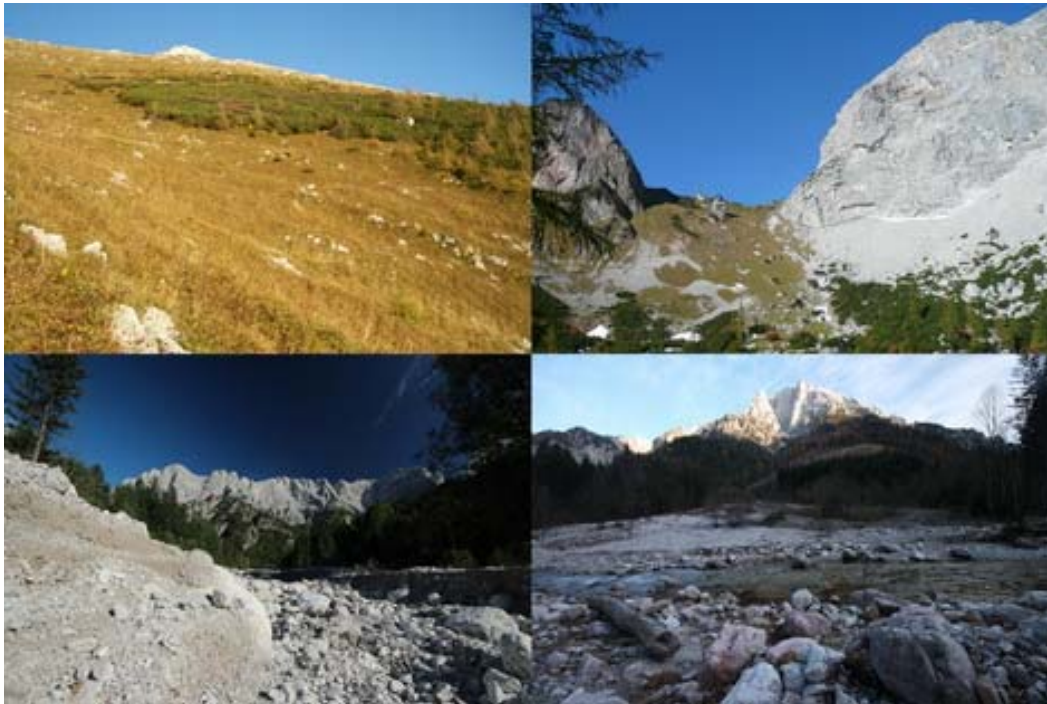
Figures 1-4: The Gesäuse National Park with its impressive geomorphology and erosion areas: Lugauerplan. Sulzkarhund with the Hochzinödl. Haindlkar with the Hochtor. Kainzenalbschütt with the Großer Ödstein.

endangered species. The Gesäuse National Park is a model-region for investigations of highly dynamic events because of its distinct relief and extreme weather conditions. The presented project aims to record and analyse the animal and plant assemblages in these highly dynamic habitats as well as document the zoological and vascular plant diversity and succession.