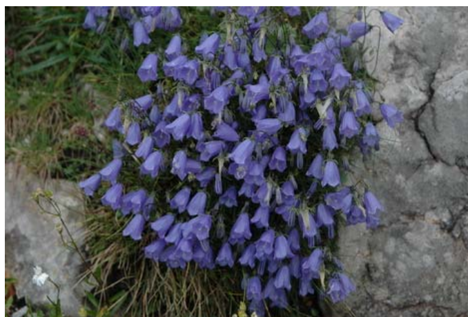
Figure 9: Usually the bellflower Campanula pulla is found in alpine habitats.