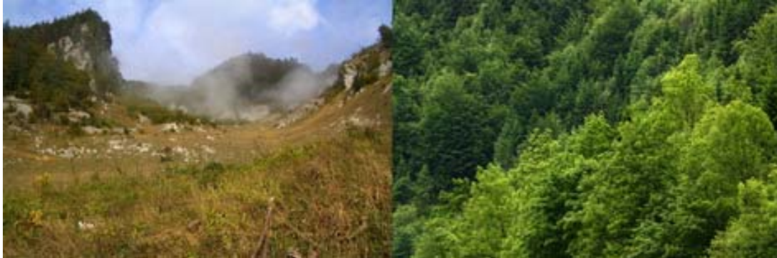
Figures 28-29: The impact of dynamic processes: an avalanche track and a forest on the southern slopes of the Tamischbachturm.

Nature reserves and national parks are among the very few areas where even the possibility exists for such unhindered dynamic processes. But even in these so called “strongly” protected natural landscapes, general acceptance of natural dynamic processes resulting from variable river flows, wind or avalanches is not to be taken for granted. In fact, due to security issues concerning hydroelectric and wind power production facilities, forest resources and potential bark beetle “damages”, such habitats raise consistent and controversial discussion. A clear commitment to the acceptance of unregulated dynamic processes in these rare protected areas, amidst our otherwise highly restricted cultural landscape is required! Finally the long-term protection of biodiversity can be reached through a deeper understanding and protection of dynamic processes.