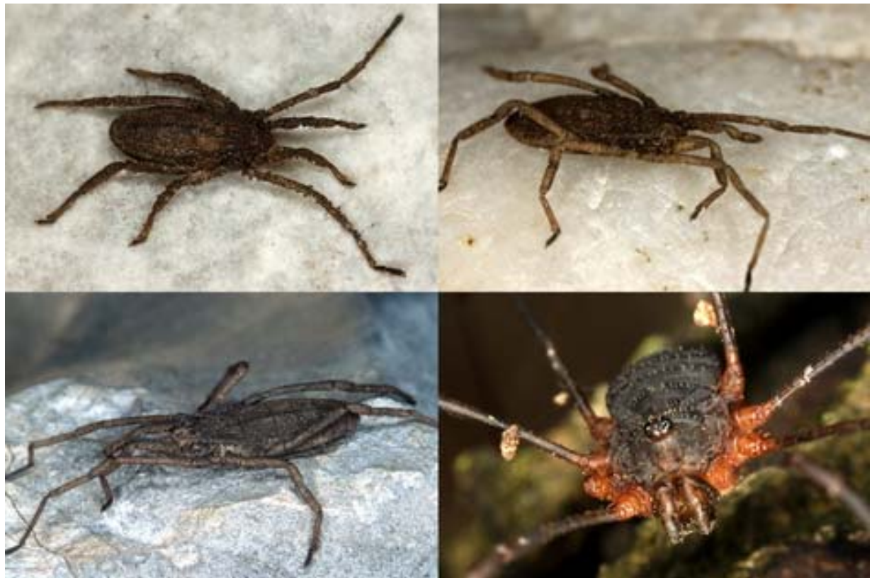
Figures 12-15: Harvestmen (Opiliones) of avalanche tracks in the Gesäuse: Trogulus tricarinatus , Trogulus nepaeformis , Trogulus tingiformis , Lacinius dentiger .

In total the species of mesophilic open grassland are dominant (32%); they are concentrated in the ruderal vegetation and the shrubby slope extensions with mainly eurytopic species. Further 30% of the species belong to the mesophilic edge- and forest species – witnesses of the diversity in structures and the tendency of forest-growth on the brim of the erosion tracks. One fourth of the species is xerothermophilic – a quite high value for an inneralpine montane locality. Remarkable is the well represented guild of xerophilic, epigeal bug species. Four (7%) montane-alpine species of open land complete this rich bug coenosis.