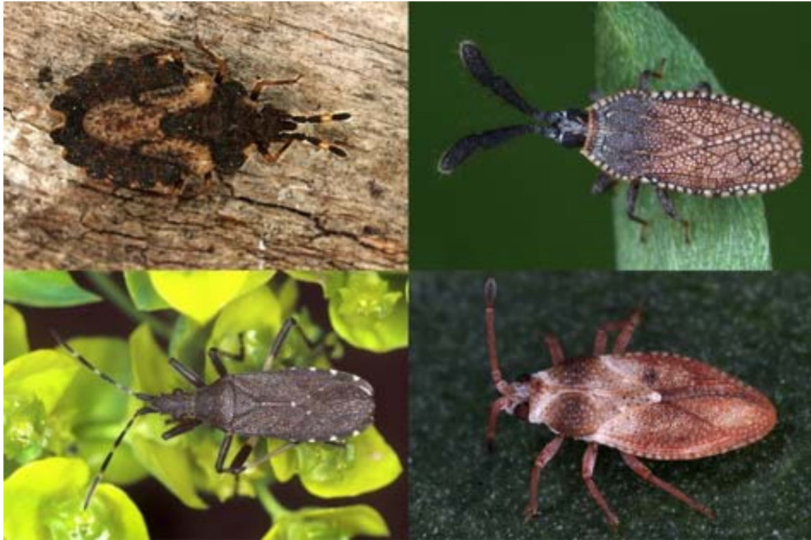
Figures 20-23: True bugs (Heteroptera): Aradus versicolor is fungicolous on beech-deadwood. Copium clavicorne is xerothermophilic and lives on Teucrium chamaedrys . Dicranocephalus medius ist xerothermophilic and lives on Euphorbia . Oncochila simplex can be found on Euphorbia cyparissias in warm and dry habitats.

Both plants and animals are known for using avalanche tracks as sliding transport corridors. Rockfalls seems to be a quite common, quick and frequent way of downhill transport for nests of eggs, juvenils and adults. This dangerous dispersal mechanism inside avalanche tracks offers the advantage that the arrival area contains a wide spectrum of different habitat types and microclimatic niches. Therefore the chance of finding suitable conditions is quite good to establish long-lasting populations. Furthermore, the valley-populations of these alpine species can count on a regular supply of new colonists from higher elevation habitats.