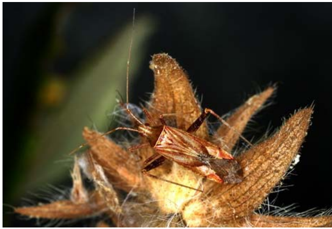
Figure 24: The thermophilic true bug Phytocoris austriacus , living on Melampyrum pratense , has been recorded in the Kalktal; it is new to Styria.