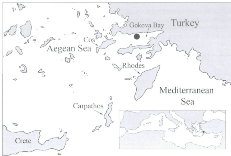
Figure 1. Sampling locality (●) of Strombus (Doxander) vittatus vittatus Linnaeus 1758, in Gokova Bay.