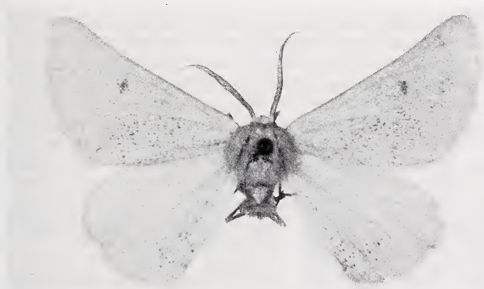
Fig. 3. Dyscia karsholti sp.n. ♂ holotype.

HABITAT : DR. KARSHOLT caught the two species using a 12W actinic tube between Nerium bushes in a nearly dry river-bed. Our knowledge of the usual foodplants of the genus, however, would indicate that the species had not bred on the oleander bushes, but on dwarf steppe herbs on adjacent terrain.