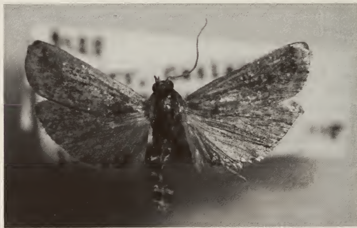
Fig. 1. Holotype ♂, Euzophera fibigerella sp. n., Turkey, Prov. Gaziantep, 16 km NE Kadirli, 700 m, 10.VII.1987 (leg. M. Fibiger).

DESCRIPTION. External characters (fig. 1). Exp. 17 mm, forewing 8 mm. Frons flatly curved, adjacently scaled, without a cone of scales. Proboscis entirely rudimentary. Labial palps slightly upcurved, 1,5 ×