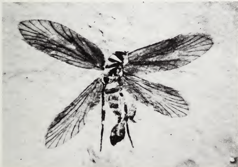
Fig. 2 + Undopterix sukatshevae Skalski

There are 5 specimens from Siberian amber, among them 4 imagines and one fragment of a caterpillar which does not allow more precise determination. Three imagines represent Homoneura and one specimen belongs to the Incurvariidae. But only one homoneurous specimen is excellently preserved (Fig. 1). Its mouth parts, anal sector of forewing venation and valva are very similar to that in the Australian family Lophocornidae (Common 1973), but the very long edaeagus with long paramere is developed as in the Eriocraniidae. On the foretibia there is an epiphysis. The genital armature has well developed tegumen. In the forewing venation the radial and medial sector are similar to that in the Micropterigidae. The hindwing is a different type, veins r_2 and r_3 arise directly from the r stream. The specimen shows a mixture of characters from several recent families of the Homoneura. The forewing venation of second homoneurous inclusion can be compared with that in the New Zealand Mnesarchaeidae. In the next inclusion only a fragment of forewing with venation of the Homoneura type is preserved. The incurvariid specimen is also well preserved. Its mouth parts, venation of both wings, coupling mechanism of the hindwing consisting of a single spined frenulum and row of stout spines on humeral margin, shape and form of epiphysis on the foretibia are typically developed as in the Incurvariidae. This specimen is very near to recent incurvariids.