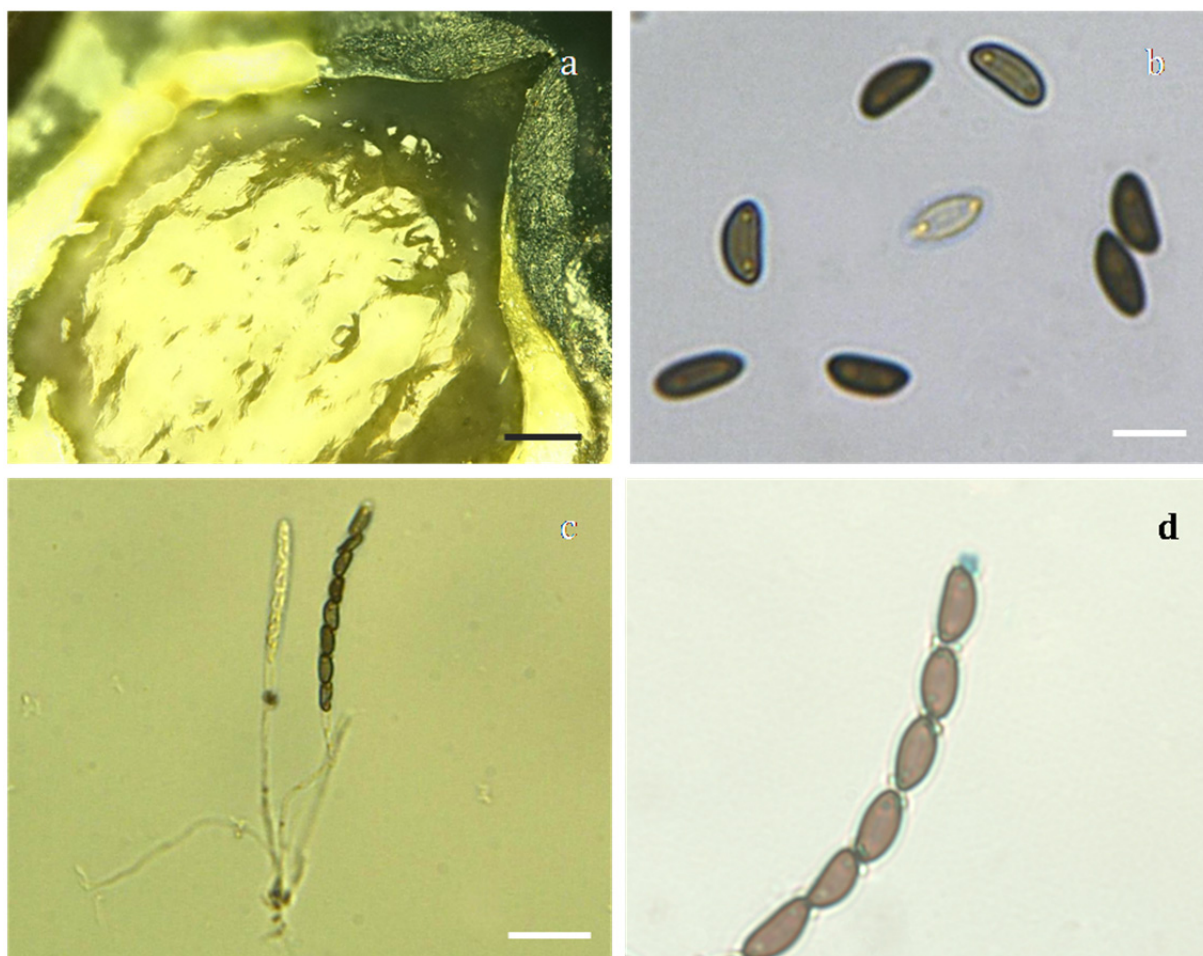
Fig. 3. Xylaria curta (HMJAU23989). a Perithecia and conic ostiole. b Ascospores. c Asci. d Ascus apical ring. Bars: a 74 \mu\text{m} , b 8 \mu\text{m} ; c 25 \mu\text{m} , d 8 \mu\text{m} .

The rDNA- ITS1-5.8S-ITS2-sequence with 589 bps of X. partita (MF045812) differs from any known Xylaria sequences. Through a Blast search against the sequences in GenBank DNA database, the rDNA-ITS sequence of the species can be compared with 1009 max scores and 98% maximal identities (JX256819, KU940160), and 990 max scores and 98% maximal identities to those of X. bambusicola Y. M. JU & J. D. ROGERS (EF026123, GU300088) (JU & ROGERS 1999), respectively. However, X. bambusicola can be distinguished from X. partita by morphological characters. X. bambusicola grows on bamboo culm, and has larger stromata up 9 cm long, short acute sterile apices, and slightly smaller ascospores, 9.5\text{--}11\text{--}(12.5) \times 4\text{--}5 \mu\text{m} , sometimes with a tiny hyaline cellular appendage on one end (HSIEH & al. 2010).