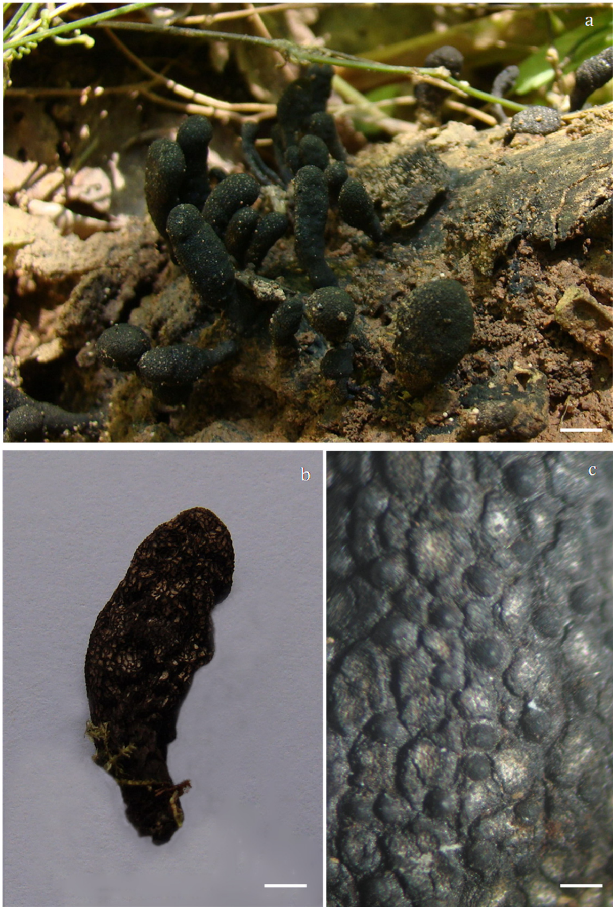
Fig. 2. Xylaria curta (HMJAU23989). a, b Stromata. c Stromatal surface. Bars: a 8.5 mm, b 4 mm, c 0.8 mm.