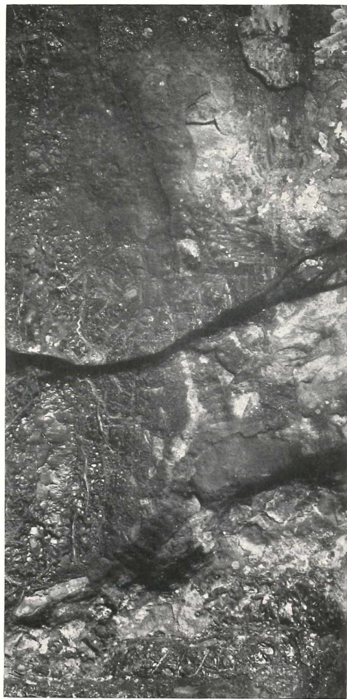
Fig. 1 b. Stem of Melocrinus on Callixylon neuberryi . Left end of the longest stem. Note quartz-pyrite-filled shrinkage crack to the left with disarticulated end of the stem. 1.

shale. Elsewhere stems and plates of this species occur abundantly in a similar layer in the middle of the Olentangy near Delaware, Ohio. 3 Crinoid stems have been reported from the concretions at the base of the Ohio shale in Delaware county by WESTGATE. 4*