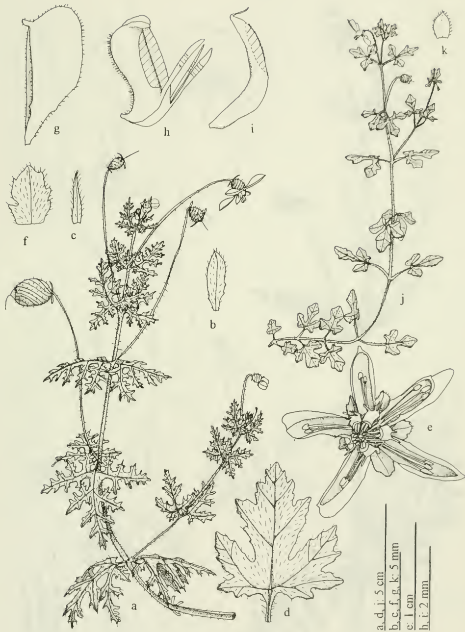
Fig. 1: Blumenbachia insignis (Sparre 235): a habit; b bract; c sepal. B. hieronymi , cult. at M: d leaf; e flower; f sepal; g petal; h scale, lateral view; i staminode. B. catarinensis (Smith & Klein 7832): j habit; k sepal.