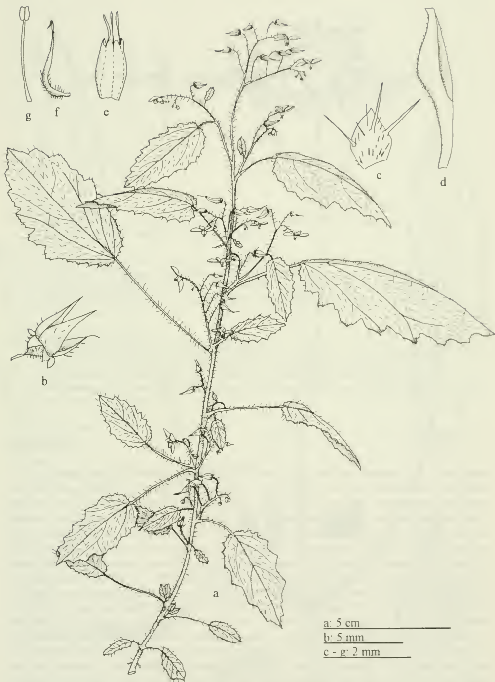
Fig. 5: Loasa rostrata (Andersson 9219): a habit; b fruit; c sepal; d petal; e scale dorsal; f staminode; g stamen.