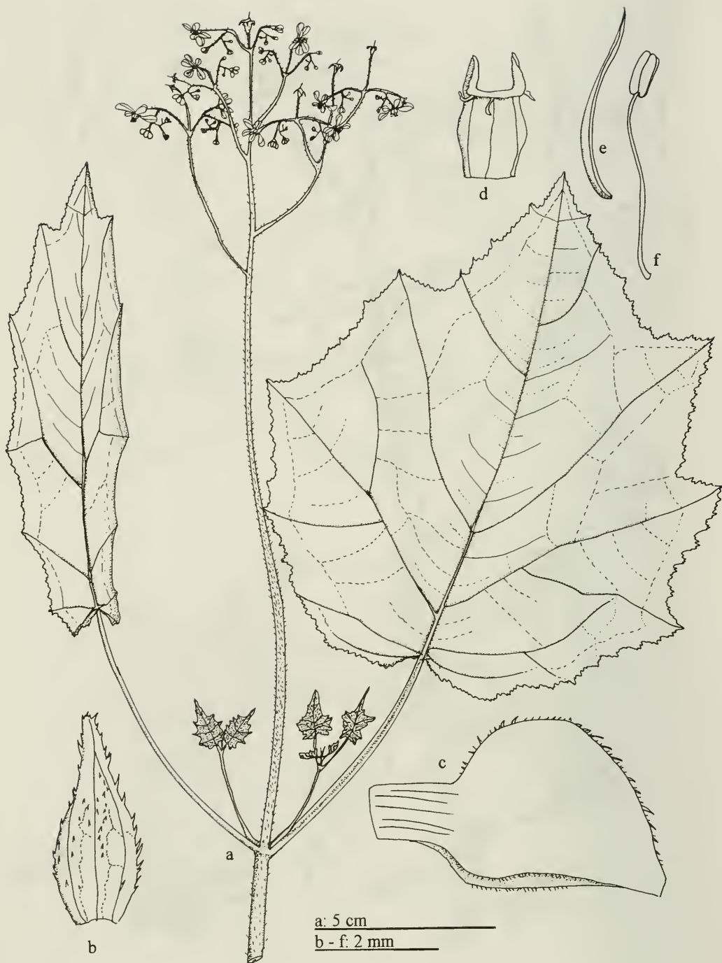
Fig. 6: Loasa uleana (Ule 3713): a habit; b sepal; c petal; d scale dorsal; e staminode; f stamen.