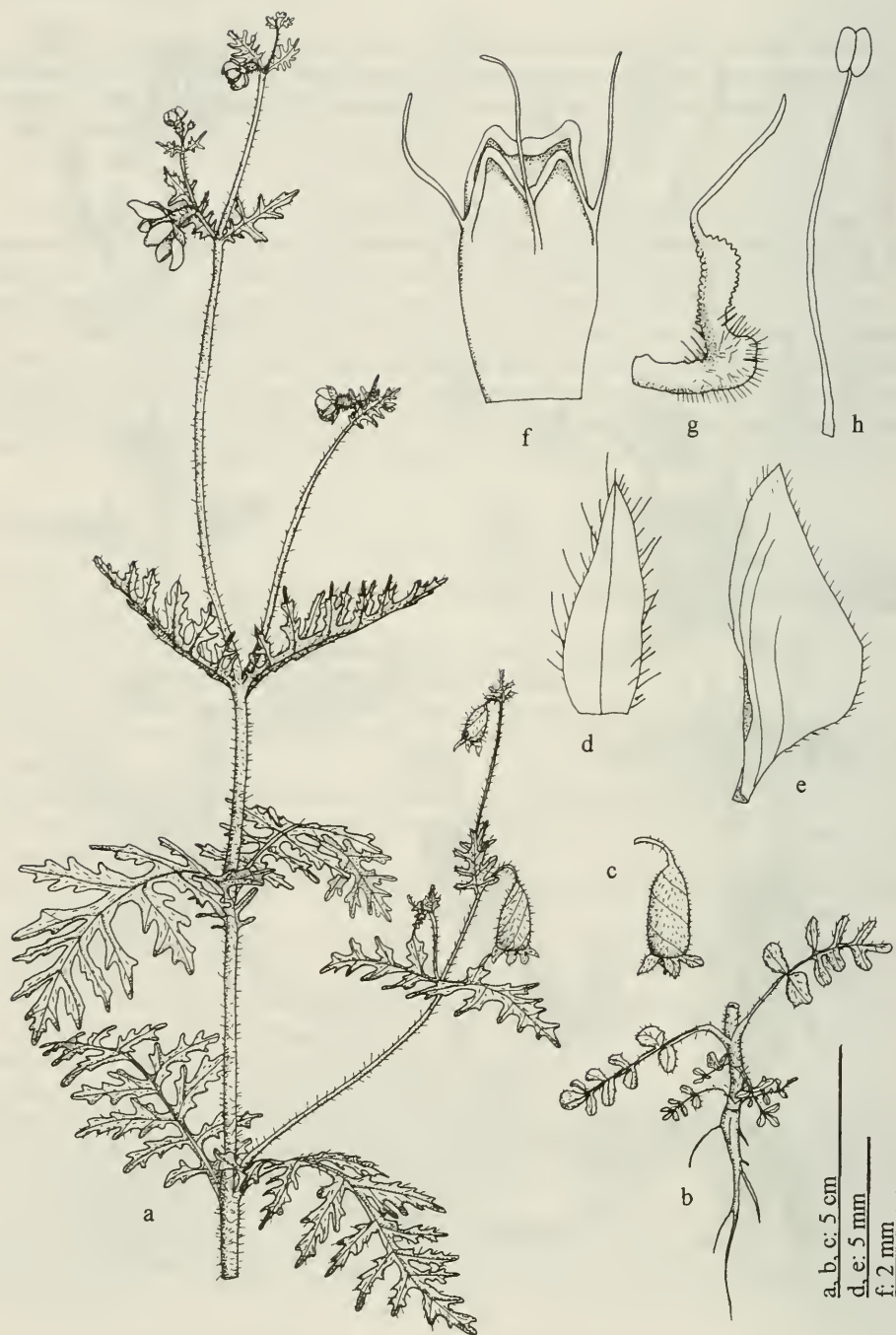
Fig. 2: Cajophora arechavaletae (Arechavaleta 3425): a habit; b root; c fruit; d sepal; e petal; f scale, dorsal view; g staminode; h stamen.