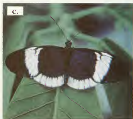
Figure 1: a: Flowers of Passiflora tina R.Boender & T.Ulmer grouped in dense fascicles (Boender 744, cultivated); b: Flower, close up showing the corona series; c: Heliconius sapho candidus Brown.