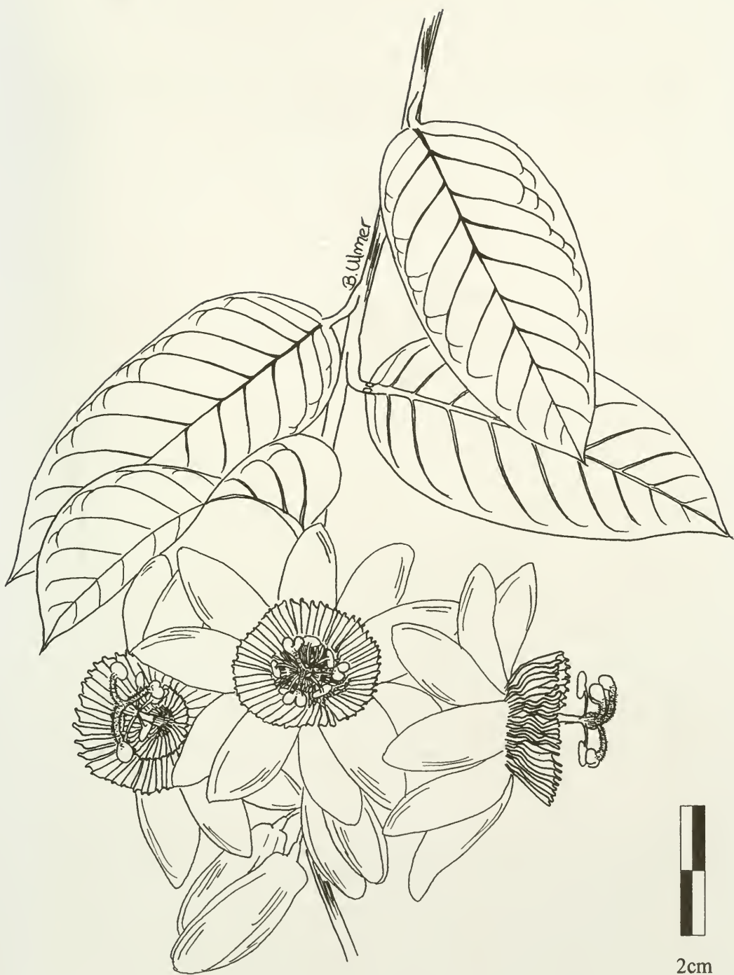
Figure 2: Habit of Passiflora tina .