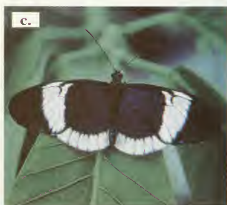
Figure 1: a: Flowers of Passiflora tina R.Boender & T.Ulmer grouped in dense fascicles (Boender 744, cultivated); b: Flower, close up showing the corona series; c: Heliconius sapho candidus Brown.