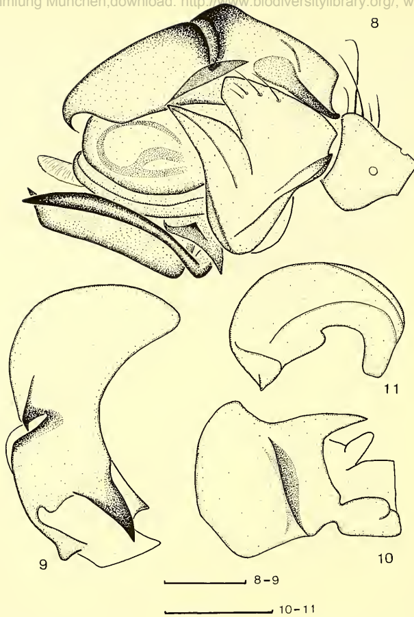
Figs. 8–11. Troglohyphantes adjaricus spec. nov.; ♂ holotype. – 8) left palp; 9, 10) cymbium (prolateral and dorsal view, respectively); 11) embolus.

Diagnosis: The new species joins the orpheus -group and seems to be especially closely related to deelemanae spec. nov., but is well different from the latter by the lack of a basal tubercle on the male palpal tibia and of a dorsal abdominal pattern, certain details of the shape of the cymbium, absence of a tegular and presence of a radical membrane of the palp.