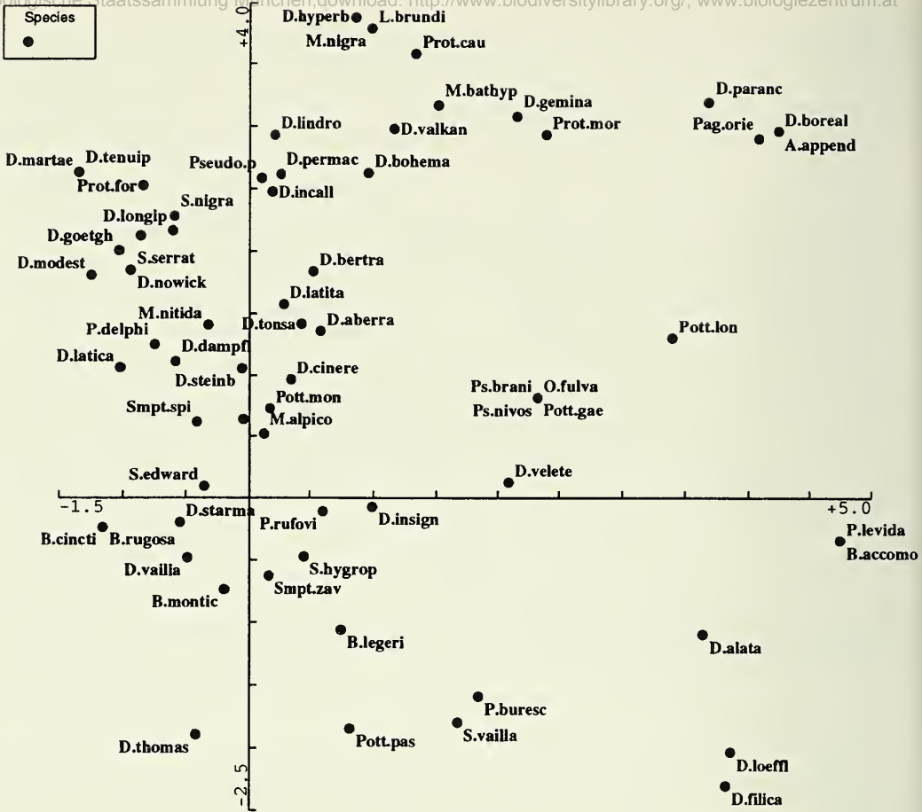
Fig. 4. Detrended correspondence analysis results, species scores; abscissa 1st axis, ordinate 2nd axis; abbreviations of genera names: B: Boreoheptagyia ; Prot: Protanypus ; Pag: Pagastia ; Ps: Pseudodiamesa ; D: Diamesa ; S: Syndiamesa ; Pseudo: Pseudokiefferiella ; Pott: Potthastia ; Smpt: Sympotthastia ; M: Monodiamesa ; P: Prodiamesa .