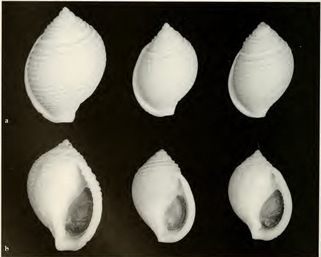
Fig. 2. Oocorys morrisoni , spec. nov. Holotype and paratypes. a. Dorsal view. b. Ventral view.