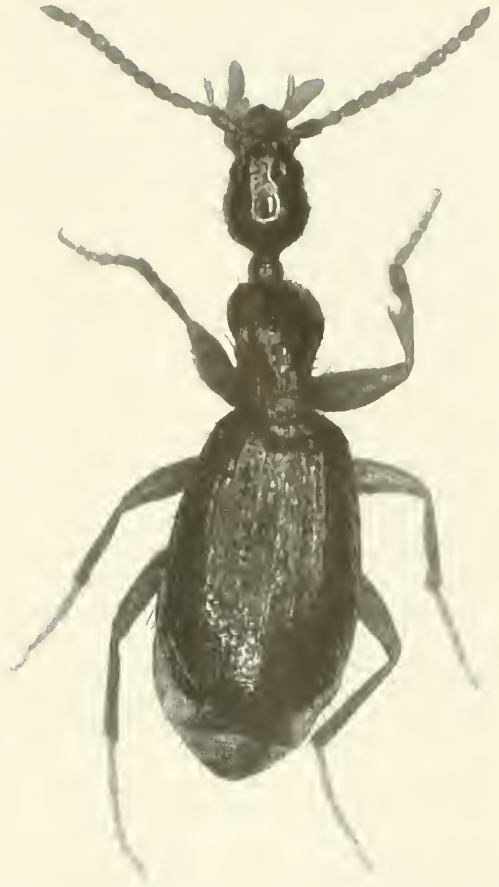
Fig. 4. Gunvorita bihamata , spec. nov. Habitus. Length: 5 mm.

cised, basal angles slightly projecting, obtuse. Lateral margin rather inconspicuous, without distinct border line, marginal channel absent. Median line fine, not impressed. Prebasal grooves almost invisible. Anterior marginal seta elongate, situated at anterior third of pronotum, posterior marginal seta shorter, situated right on basal angle. Surface without microreticulation, glossy, with moderately sparse, coarse puncturation. Distance between punctures c. 2\times as wide as diameter of punctures.