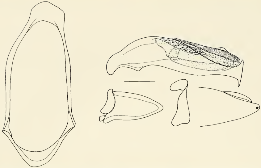
Fig. 1. Gunvorita bihamata , spec. nov. ♂ genitalia: aedeagus (left side), shape of apex (from below), left and right parameres, genital ring. Scale: 0.25 mm.

posteriorly widened, rather oval shaped head; further distinguished from the next relatives, G. hamifera Baehr and G. nepalensis Baehr, by shape of aedeagus which has the apex sharply upturned and bears a straight crotchet at the very tip that forms a straight line with the apex.