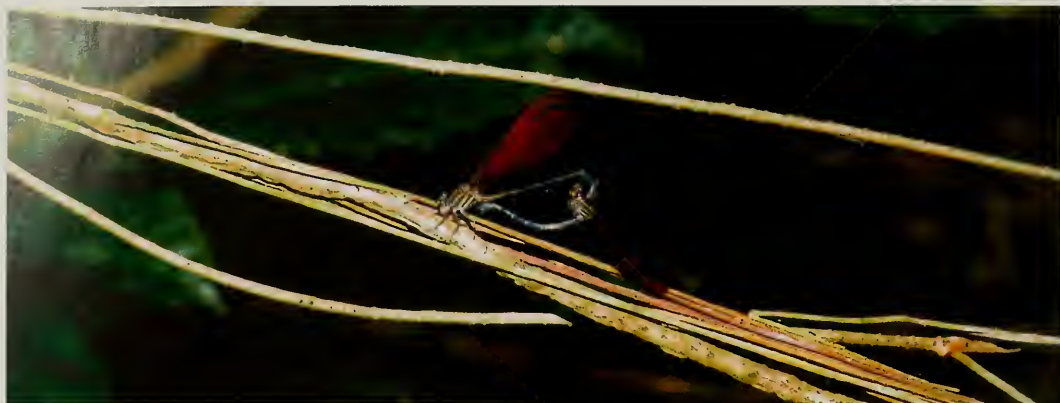
Fig. 5. Polythore spaeteri , spec. nov., male (holotype) and female (allotype) in copulation.