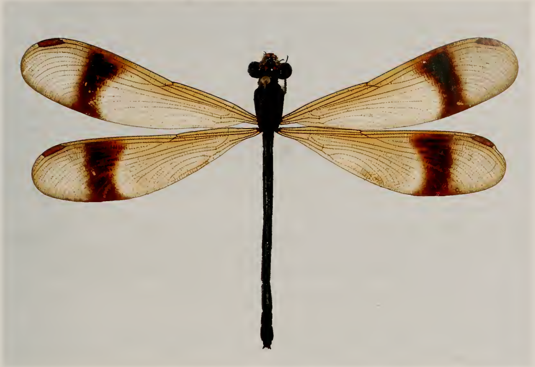
Fig. 2. Polythore spaeteri , spec. nov., female (paratype).

Pterothorax. Black with 5 orange to yellowish stripes arranged in the typical manner described by Bick & Bick (1985) in Polythore lamerceda . Legs black, inner side of femora pale.