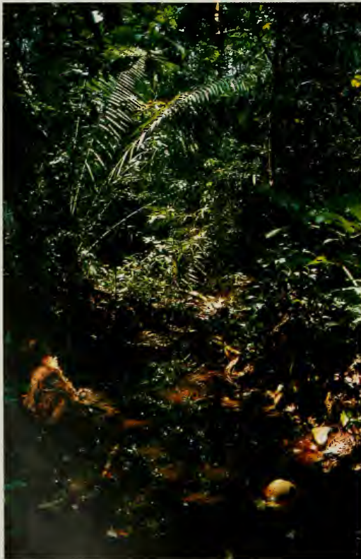
Fig. 6. Locality of Polythore spaeteri, spec. nov. (copula) in the rain forest of Panguana after first rain.