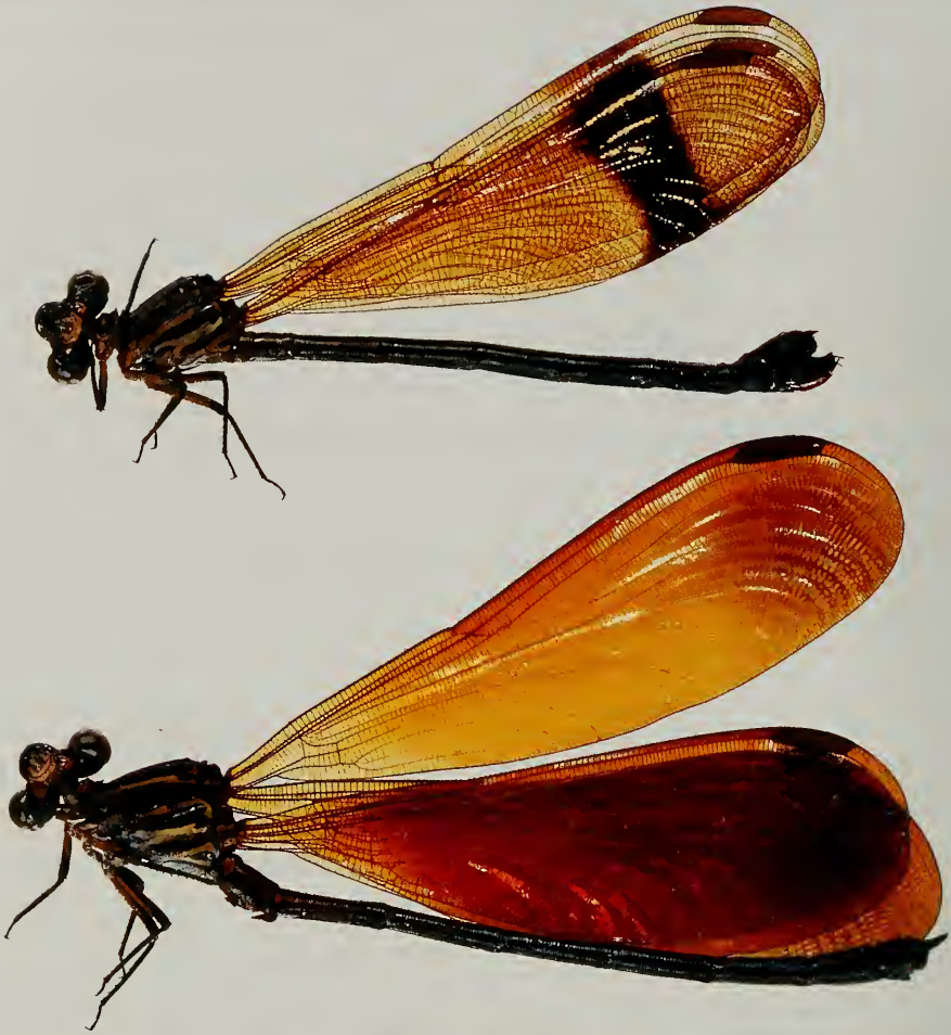
Fig. 1. Polythore spaeteri , spec. nov., allotype female (top), holotype male (bottom).