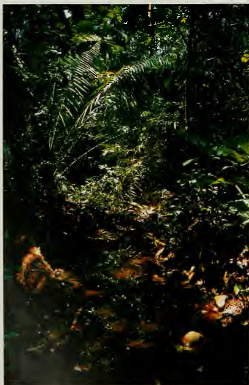
Fig. 6. Locality of Polythore spaeteri, spec. nov. (copula) in the rain forest of Panguana after first rain.