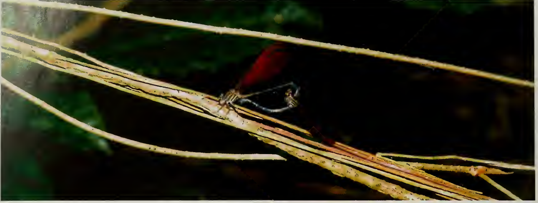
Fig. 5. Polythore spaeteri , spec. nov., male (holotype) and female (allotype) in copulation.