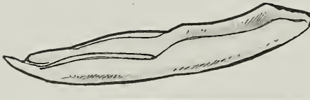
Fig. 3. Derivative, apomorphic position of the male copulatory organ in Lachnogyini. Aedeagus of Lachnogyia squamosa Ménétriés. Scale bar: 0.6 mm.