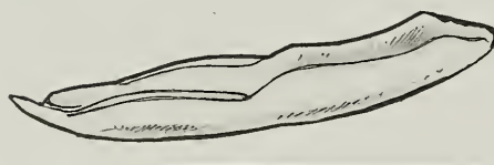
Fig. 3. Derivative, apomorphic position of the male copulatory organ in Lachnogyiini. Aedeagus of Lachnogyia squamosa Ménétries. Scale bar: 0.6 mm.