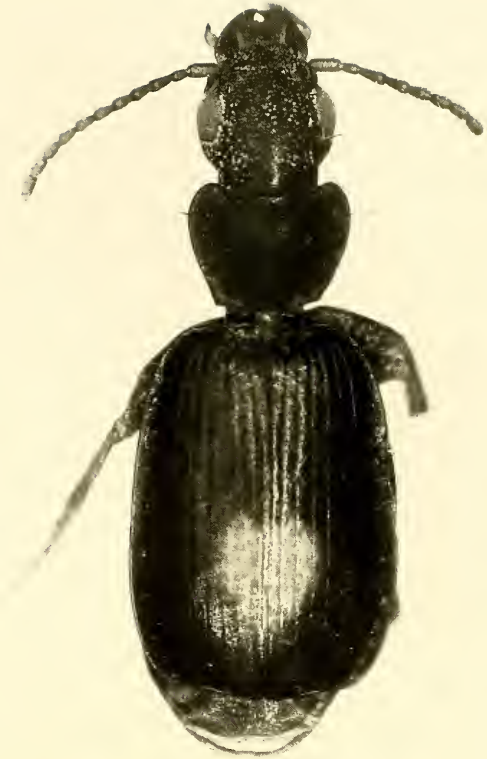
Fig. 2. Anomotarus cordifer , spec. nov. Habitus. Length: 3.6 mm.

Note. Although the type(s) of this widespread Australian species are lost (Moore et al. 1987, Baehr in press), it is rather easily identified by size, shape, absence of the apical elytral spot, and extremely inconspicuous or almost completely wanting hu-