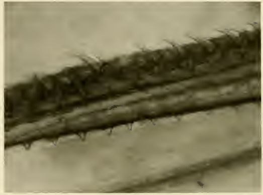
Fig. 2. Hisonotus candombe , spec. nov. Pectoral spine showing the serrae on the posterior margin of the spine (× 50).

Color in life: ground color of dorsum and flanks bright green, ventral surface of head and trunk pale yellowish. Narrow light stripes from snout tip to eye and from eye to lateral tip of posttemporo-supracleithrum. Dorsum of body, upper third of flanks, and