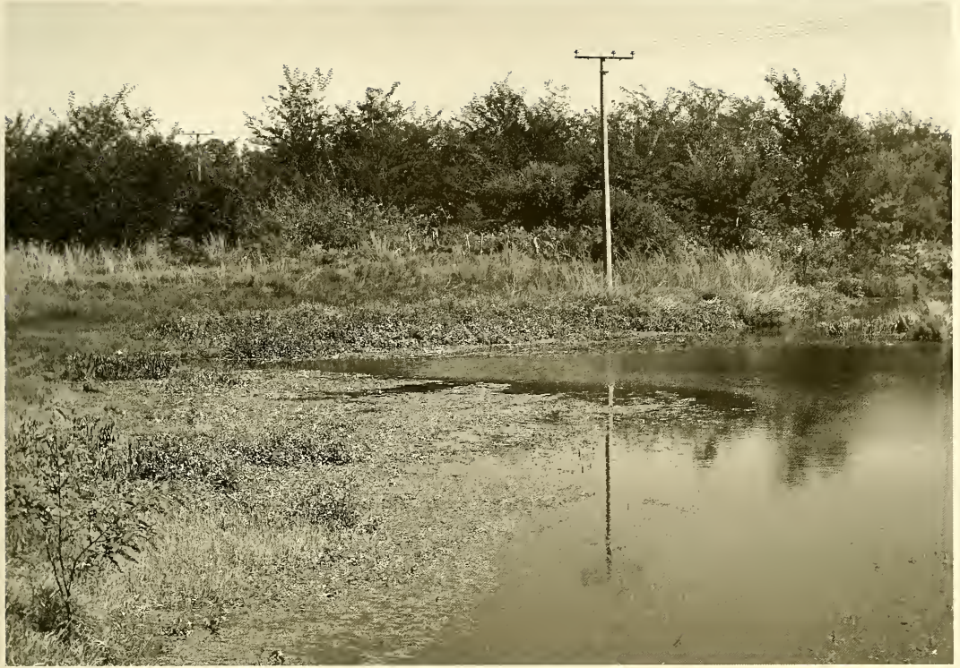
Fig. 4. Arroyo Palomas, type locality of Hisonotus candombe spec. nov.

er, 1891): AI 178, 6 ex., 30.0-38.0, Brazil, Rio Grande do Sul, São Leopoldo, Yacuí, rio dos Sinos. Hisonotus sp. B, AI 120, 1 ex., 23.3, Argentina, Misiones, río Uruguay basin, arroyo Oveja Negra. Hisonotus sp. C: MHNG 2408.025, 10 ex., 17.8-29.0, Paraguay, route 2, arroyo Pirayu. Hisonotus ringueleti Aquino, Schaefer & Miquelarena, 2001: AI 179, 1 ex., 36.4, República Oriental del Uruguay, Departamento Artigas, río Uruguay basin, arroyo Lenguazo. Hypoptopoma inexpectatum (Holmberg, 1893): AI 119, 1 ex., 35.0, Argentina, Corrientes province, río Paraná, Puerto Abra. Otocinclus flexilis Cope, 1894: AI 117, 2 ex., 36.0-36.5, Argentina, Entre Ríos province, arroyo Ñancay. Otocinclus vestitus Cope, 1872: AI 118, 3 ex., 26.0-30.4, Argentina, Corrientes province, río Paraná, Puerto Abra. Otocinclus vittatus Regan, 1904: AI 121, 1 ex., C&S, 27.0, Argentina, Corrientes province, río Paraná, Ita Ibaté. AI 127, 1 ex., 26.2, Argentina, Buenos Aires province, Río de la Plata basin, arroyo El Pescado. Epactionotus yasi Almirón, Azpelicueta & Casciotta, 2004: MACN-ict 8649, 1 ex., 32.0, Argentina, Misiones province, río Iguazú basin, arroyo Lobo. Epactionotus aky Azpelicueta, Casciotta, Almirón & Körber, 2004: AI 124, holotype, 30.5, Argentina, Misiones province, río Uruguay basin, Arroyo Garibaldi.