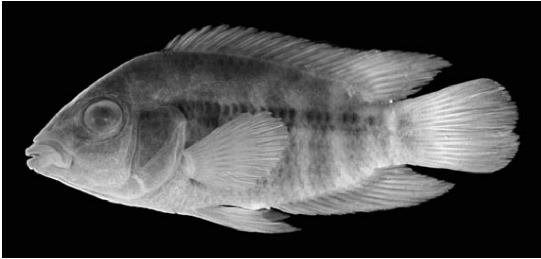
Fig. 1. Australoheros taura , sp. n.; Holotype, UFRJ 7574, 65.4 mm SL; Brazil, Rio Grande do Sul: rio Jacuí basin: rio das Antas.

Comparative material. Australoheros facetus : Uruguay: UFRJ 7596, 8, 32.3-95.7, bañado Higoeritas, Nueva Palmira; Ringuelet.