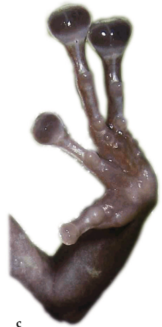
Fig. 1. Voucher of calling male of Tsingymantis antitra (ZSM 1200/2012=ZCMV 13527, snout-vent length 55.2 mm) in the “tsingy” limestone at Ankarana National Park: a , dorsolateral view in life; b , ventral view; c , palmar surface of left hand.