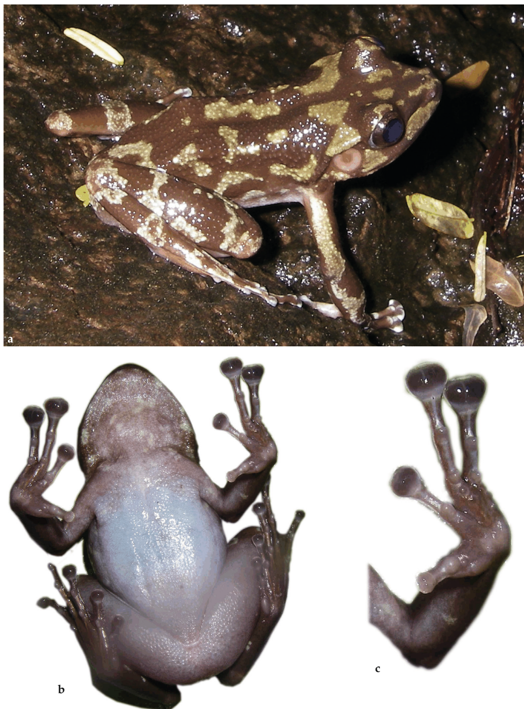
Fig. 1. Voucher of calling male of Tsingymantis antitra (ZSM 1200/2012=ZCMV 13527, snout-vent length 55.2 mm) in the “tsingy” limestone at Ankarana National Park: a , dorsolateral view in life; b , ventral view; c , palmar surface of left hand.