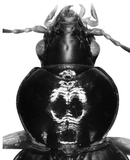
Fig. 4. Mecyclothorax obtuseangulatus spec. nov. Head and pronotum.

posterior base of pronotum, median antennomeres c. 2\frac{1}{4} \times as long as wide. Surface impunctate, without microreticulation, very glossy.