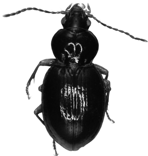
Fig. 3. Mecyclothorax obtuseangulatus spec. nov. Habitus. Body length: 3.5 mm.