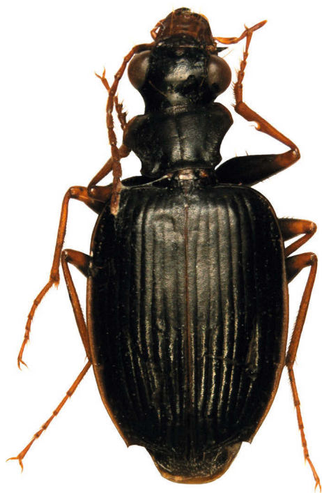
Fig. 1. Mochtherus dentatus , spec. nov. Habitus. Body length: 7.9 mm.

cleaned for a short while in 10 % KOH. The habitus photograph was obtained by a digital camera using ProgRes CapturePro 2.6 and AutoMontage and subsequently was edited with Corel Photo Paint 14.