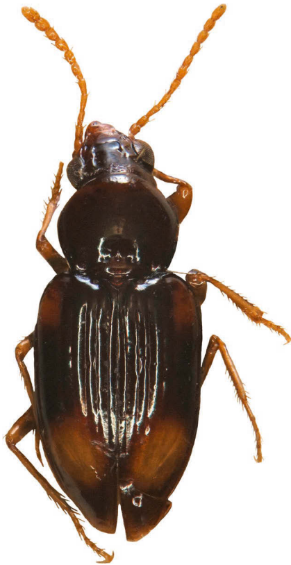
Fig. 1. Tachyura patruelis , spec. nov. Habitus, body length: 2.7 mm.