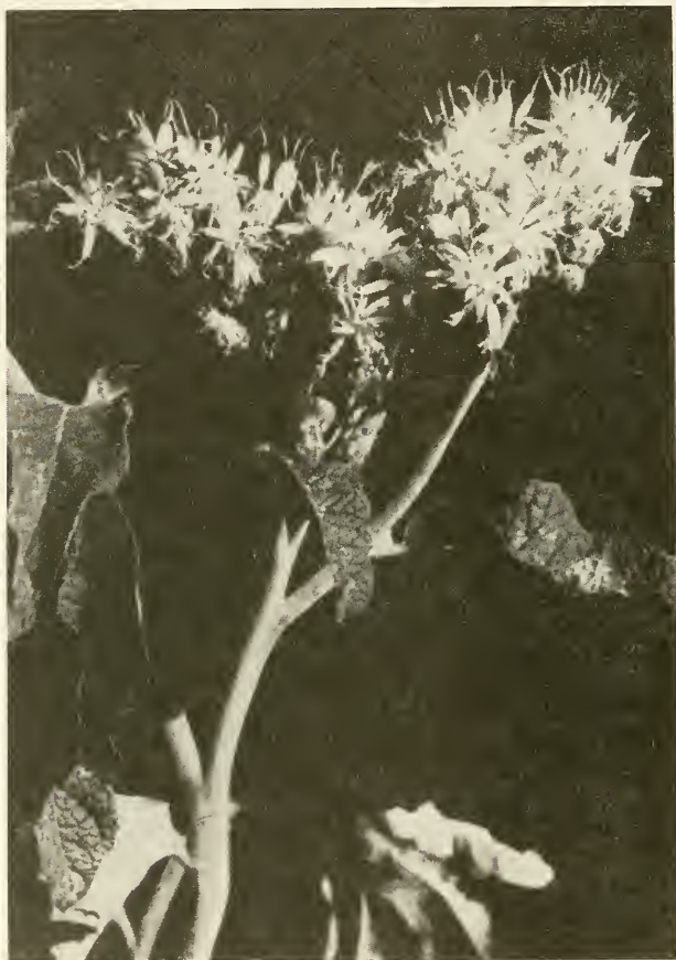
Fig. 3. Vernonia spec. — Biotop of Trupanea woodi Bezzi, Trupanea aurea Bezzi, Scedella dissoluta (Loew), Scedella glebosa Munro, Stylyia sororcula Wied., Rhabdochaeta nigra Bezzi, Rhabdochaeta spec., Cladotricha spec., Urophora pantomelas Bezzi.

Es waren drei ökologische Gegebenheiten, die in besonderer Weise das Vorkommen einiger Trypetiden-Arten begünstigten und ihre Beobachtung und Erbeutung ermöglichten.