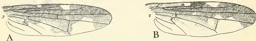
Fig. 1. Ocneria lindneri n. sp., wing, A ♂, B ♀.

This new species comes within the meaning of the genus Ocnerioxa given by BEZZI in 1924. It differs from all the other species in the absence of a dark, blackish bar or stripe along the top of the mesopleura, the so-called notopleural stripe, and from all except woodi BEZZI in the absence of the presutural bristle. It differs further from woodi in the absence of a dark bar across the epistome. The two specimens described here are so alike, apart from a slight difference in wing-pattern, that they must represent the same species.