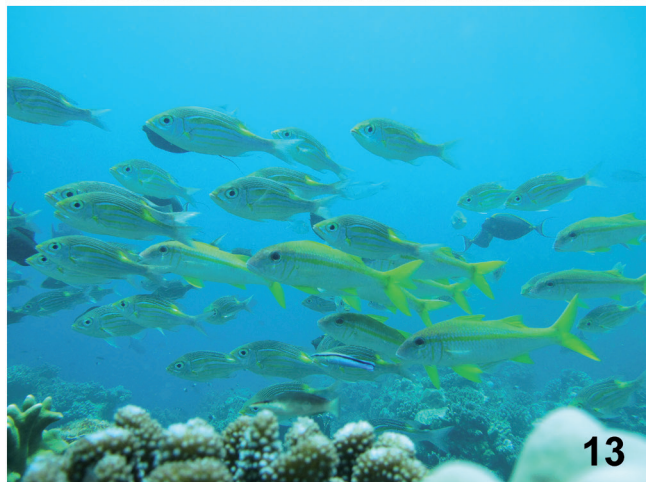
Figs. 8–13. Shore fishes of Europa Island. – 8. Epinephelus tukula ; photograph by P. DURVILLE, April 2011. 9. Priacanthus hamrur ; photograph by P. DURVILLE, April 2011. 10. Caranx melampygus ; photograph by E. BRETAGNE, Oct. 2011. 11. Gerres longirostris ; photograph by P. BORSA, 7 April 2011. 12. Monotaxis grandoculis ; photograph by P. BORSA, 5 April 2011. 13. Mulloidichthys vanicolensis (foreground) and Gnathodentex aureolineatus (background); also includes Labroides dimidiatus and Gomphosus caeruleus (below), and Naso elegans (background right); photograph by P. DURVILLE, April 2011.