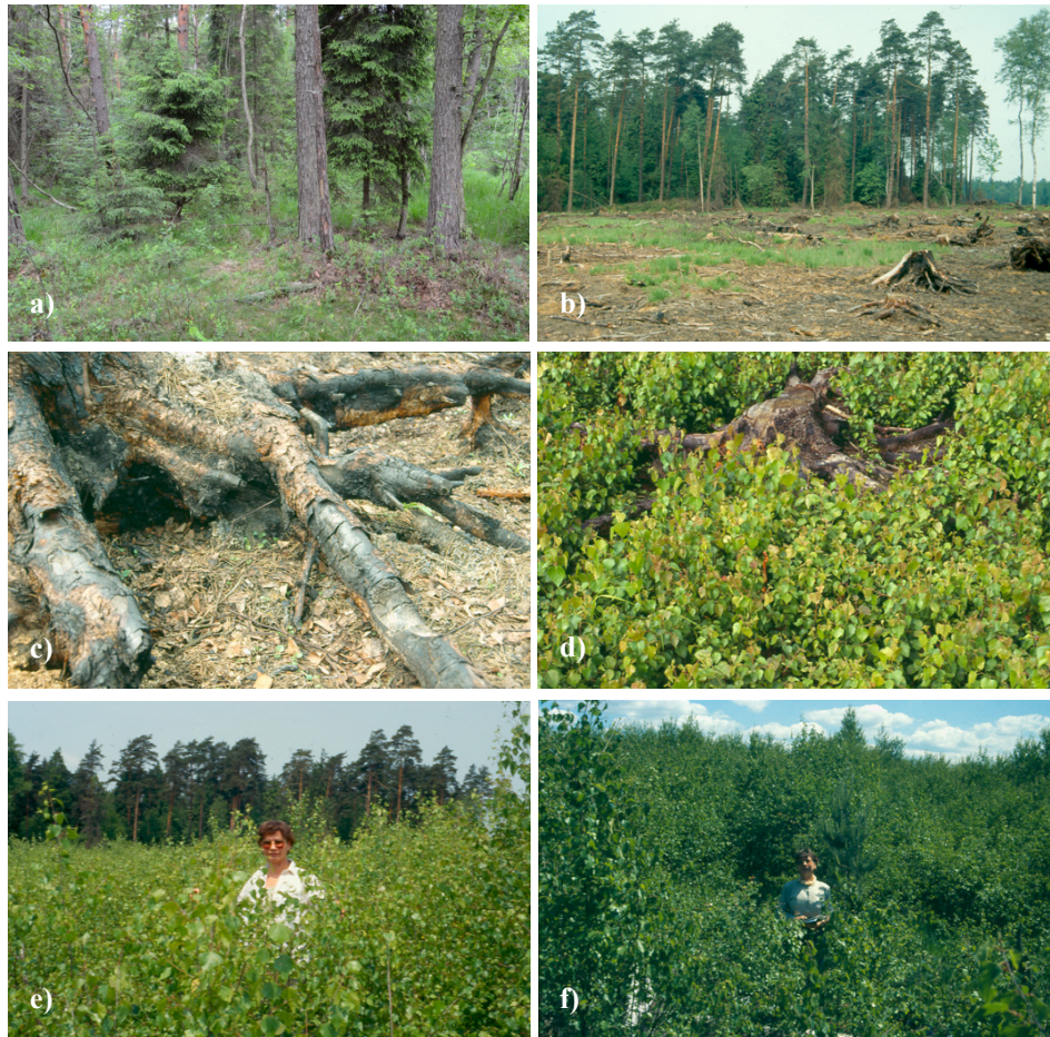
Fig. 2. a) Unburned forest; b) Part of the burned area in June 1993; c) The heavily burned site in June 1993; d) Seedlings of birches on the heavily burned site in May 1994; e) Young birches on the heavily burned site in June 1996; f) Vegetation on the heavily burned site in June 2000. (Photos: 2.a–d Z. Dzwonko; 2.e–f S. Gawroński).

Abb. 2. a) nicht verbrannter Wald; b) Teil des verbrannten Bereichs im Juni 1993; c) Die stark verbrannte Fläche im Juni 1993; d) Keimlinge von Birken auf der stark verbrannten Fläche im Mai 1994; e) Junge Birken auf der stark verbrannten Fläche im Juni 1996; f) Vegetation der stark verbrannten Fläche im Juni 2000 (Fotos: 2.a–d Z. Dzwonko; 2.e–f S. Gawroński).