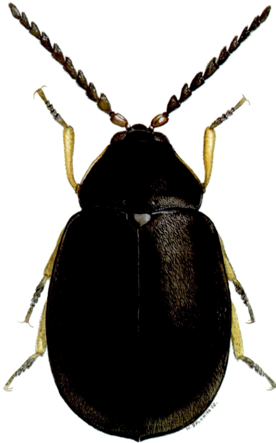
Fig. 1: Habitus of Ectopria lobata .