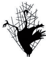
Komitee gegen den VOGELMORD