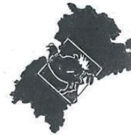
Avifaunistische Arbeitsgemein- schaft Soltau-Fallingbostel