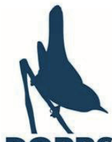
DOPPS BirdLife Slovenia