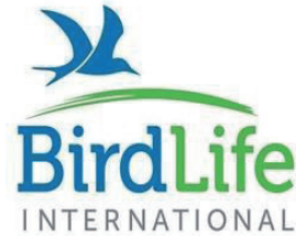
EUROPE AND CENTRAL ASIA