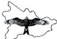
Avifaunistische Arbeitsgemeinschaft Lüchow-Dannenberg