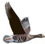
BirdWatchIreland birdwatchireland.ie protecting birds and biodiversity