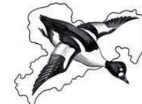
Förderverein Vogelschutzwarte Neschwitz