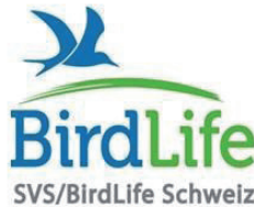
BirdLife SVS/BirdLife Schweiz