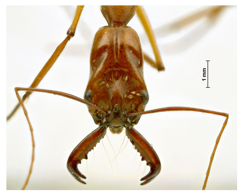
Fig. 1. Head, frontal view of Odontomachus yamanei sp.n., holotype.