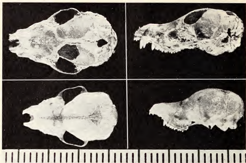
Fig. 3. Above. Skull of Myotis nattereri araxenus , No. 17. Guter Su, Azerbaijan, below: Myotis nattereri nattereri , No. 3. 857. Pampisford, Cambridgeshire, July, 1949. Dorsal and lateral views