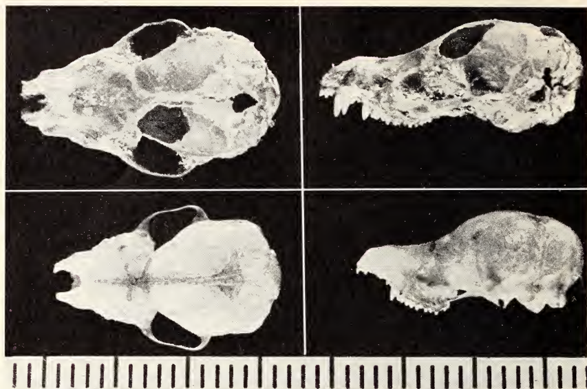
Fig. 3. Above. Skull of Myotis nattereri araxenus , No. 17. Guter Su, Azerbaijan, below: Myotis nattereri nattereri , No. 3. 857. Pampisford, Cambridgeshire, July, 1949. Dorsal and lateral views