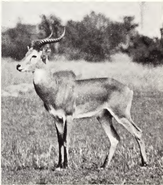
Fig. 1. Adult male Uganda kob. Height at shoulder ca. 100 cm, Weight 85–95 kg

During a study on behavior, social organization, and reproduction of the Uganda kob, Adenota kob thomasi (Neumann, 1896) (Fig. 1), it became evident that the total population of about 15 000 animals was subdivided into thirteen to fifteen units, each attached to one of the arenas or territorial breeding grounds (TGs) existing in the area (BUECHNER 1961, 1963; LEUTHOLD, in press). In over 90% of the observations tagged animals were found within 0–4 km of the TG near which they were originally captured. As there were no geographical or ecological barriers between the different TGs, the attachment to a restricted area was thought to be based on tradition within the population units; its possible ecological implications have been discussed by BUECHNER (1963, in press). To test the strength of the traditional attachment of individual males to a TG and its vicinity, several kob were transported to an area presumed to be foreign to them; the areas of capture and release were visited frequently in an effort to keep track of the animals movements.