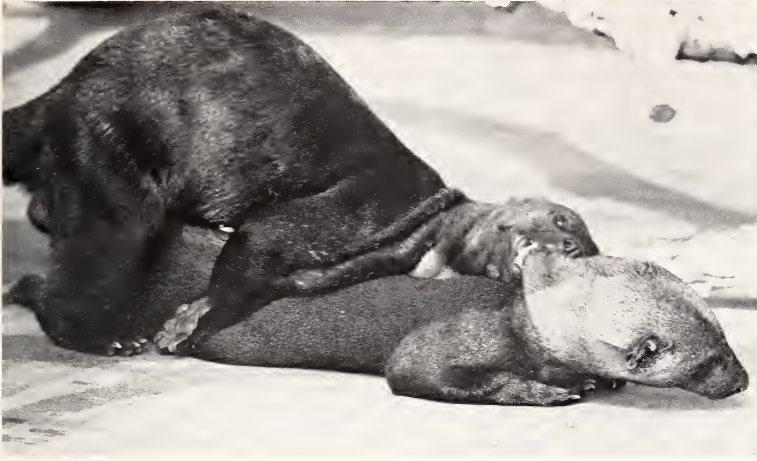
Fig. 4. Copulation. Note position of forepaws of the ♂

Scratching was observed strictly in the context of sexual situations (with one exception of the ♂ and one of the ♀), much more often in the ♀ than in the ♂; it may or may not be accompanied by the discharge of a few droplets of urine. The ♂ performs scratching with alternating movements of the feet as often as with simultaneous movements. While scratching with the hind feet, the animal may actually move forward with all four. Once the ♂ was seen after a successful copulation urinating with three short squirts and subsequent vigorous scratching.