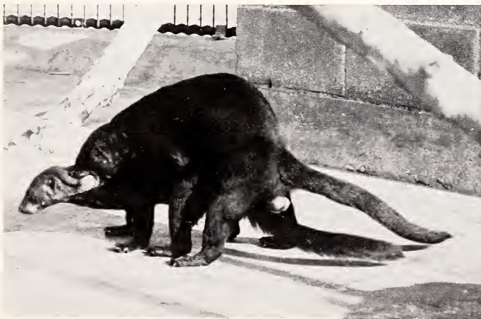
Fig. 2. ♂ mounting ♀; note nape bite and large scrotum

On January 17 both animals were transferred back to their old quarters and in the afternoon the ♂ again mounted the ♀. He held her by the nape for 25 minutes, stimulating her with pushing motions of his wrists at her flanks, but without intromission. The ♀ remained silent, but the ♂ was very vocal, keckering and uttering rasping sounds. On January 18, four copulations, two possibly with intromission, were recorded, which lasted 3 and 8 minutes; the other two were probably disrupted by zoo visitors. The ♀'s vulva was only slightly swollen. January 19: one mounting