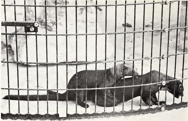
Fig. 3. Mounting of ♂ by ♀; note absence of nape bite

(16 minutes) was observed with stimulation movements and series of thrusts. Intromission was doubtful. January 20: a long lasting copulation (86 minutes) was seen during which the ♂ lost intravaginal contact once. The vulva of the ♀ was conspicuously swollen. On January 21 the ♀ struggled and thwarted the ♂, which broke off his attempts of mounting after 10 minutes.