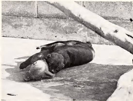
Fig. 5. Embrace. Both animals have rolled into lateral recumbency

07.45 hrs: ♀ smells at ♂'s anal region, mounts and briefly stimulates ♂, while keeping her head resting on his back; ♂ sits down, turns head to ♀ and grooms her