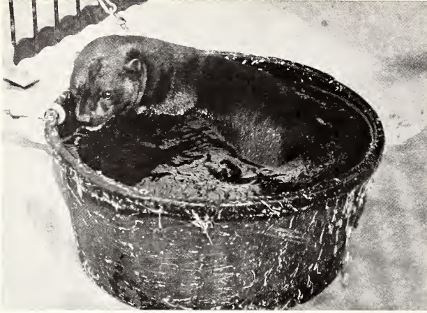
Fig. 1. ♂ in cooling bath

considerably later and re-enter it earlier. On very cold days, the den is only left for voiding and feeding. The dens are kept clean and defecation and micturition seem to occur randomly on the ground, although some preference is given to the top of the boulder; the lactating ♀, however, and later her young do use a common toilet area away from the den (POGLAYEN-NEUWALL and POGLAYEN-NEUWALL in preparation).