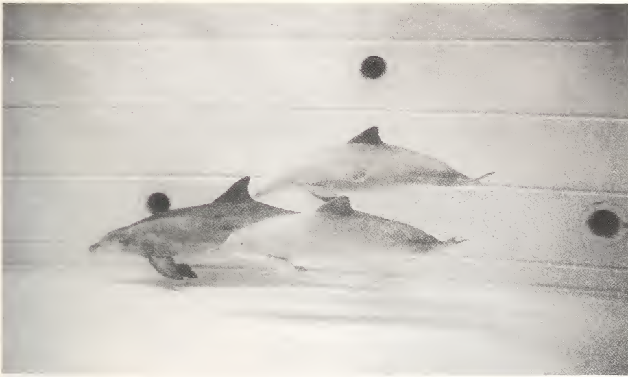
Fig. 2. Two male Sotalia (foreground) and a female Tursiops (background) in a common intergeneric swimming formation

one point, the female tucuxi used a typical male courtship display for solicitation by swimming in the belly-up position in front of, and below, the larger dolphin.