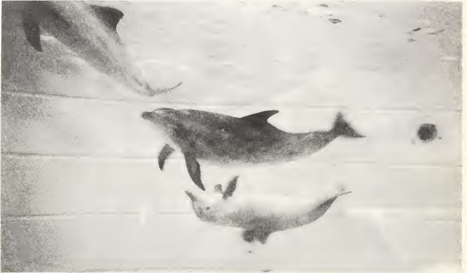
Fig. 3. A male Sotalia (bottom) attempts to copulate with a larger, female Tursiops . A second male Sotalia is at the upper left

At the peak of activity and excitement, chases sometimes included a series of aerial displays in the form of porpoising by the Tursiops , frequently joined by one or both male Sotalia . Although the strikes by the small dolphins did not appear to cause real pain, they seemed to irritate the Tursiops as their intensity escalated. The larger female appeared capable of breaking off the attacks with a quick chase, by the use of an open mouth gesture, or by jaw-claps. On all occasions observed, the aggressive interactions between the dolphins ceased on their own accord, often ending with the two species once again swimming quietly together in a loose social group.