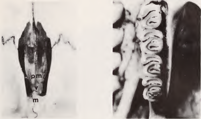
Fig. 4 (left). Ventral view of the incisive foramen of the holotype of Proechimys iberingi eliasi (MN 30524). Premaxillae (pm), maxillae (m), and vomer (v) are indicated. – Fig. 5 (right). Upper left molariform teeth of the holotype of Proechimys iberingi eliasi (MN 30524)

Teeth: Upper premolar with one or two counterfolds, upper molars with two counterfolds; lower premolar with two counterfolds and lower molars with one counterfold (Fig. 5).