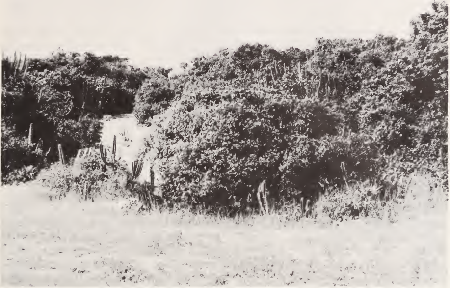
Fig. 7. Habitat of Proechimys iberingi eliasi at the Restinga da Barra de Maricá, State of Rio de Janeiro, Brazil

Measurements: Measurements (in mm) of the holotype are as follows: total length 410; tail 225; hindfoot 50; ear 25; skull length 55.4; basilar length 37.6; palatal length 18.3; toothrow length 8.3; diastema 11.5; rostral length 24.2; nasal length 19.8; interorbital constriction 12.1; rostral breadth 8.0; skull depth 13.1; rostral depth 11.2; maxillary breadth 7.6; zygomatic breadth 26.0; bulla length 11.2; post-palatal length 25.3; incisive foramen length 4.7; mandibular length 26.2. Means and ranges of all specimens examined are listed in Table 1.