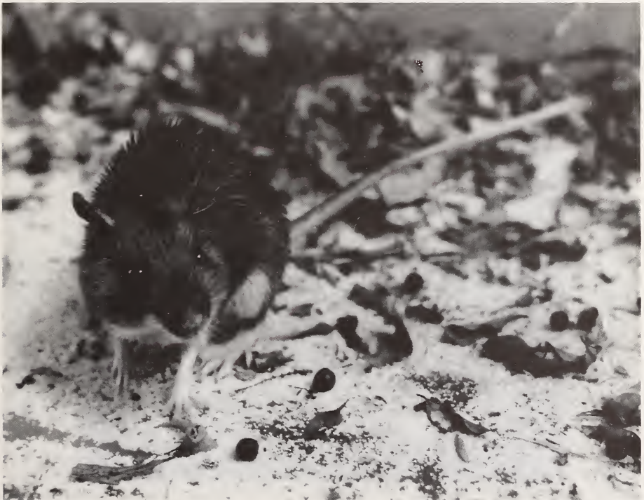
Fig. 2. Type specimen of Proechimys iberingi eliasi (MN 30524), photographed alive

Pelage: General color on upper parts blackish and underparts white (Fig. 2). Aristiforms on middorsal region: gray basally, gradually blackening toward tip; total length (mean = 21.2 mm); maximum width (mean = 1.1). Aristiforms on outer thighs: gray basally, blackening distally with Ochraceous-Tawny tip; total length (mean = 17.6); maximum