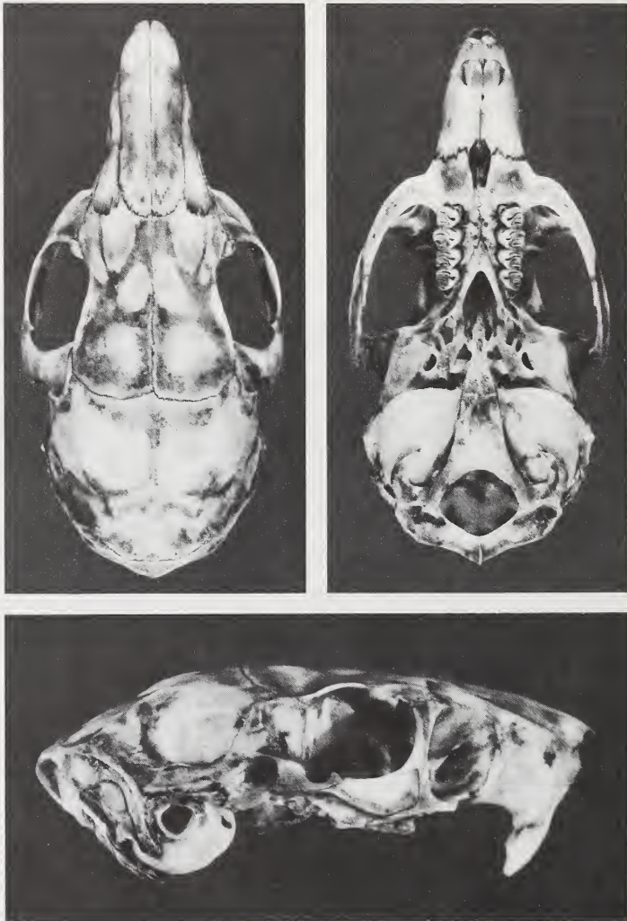
Fig. 3. Lateral, dorsal, and ventral views of the skull of the holotype of Proechimys iberingi eliasi (MN 30524)

Skull: Slender, nasals long, bullae large and well-inflated; jugals dorsoventrally wide with transverse ridge conspicuous; post-orbital process of zygoma conspicuous, formed almost exclusively by jugal; mesopterygoid fossa extending forward as far as the posterior plane of second molars; posterior palatine foramina at anterior plane of first molars (Fig. 3); incisive foramen elongate and narrow; vomerine septum complete and formed almost exclusively by premaxillae; maxillary part of vomerine sheath short; vomer visible ventrally, included between the premaxillary and maxillary portions of the vomerine septum (Fig. 4).