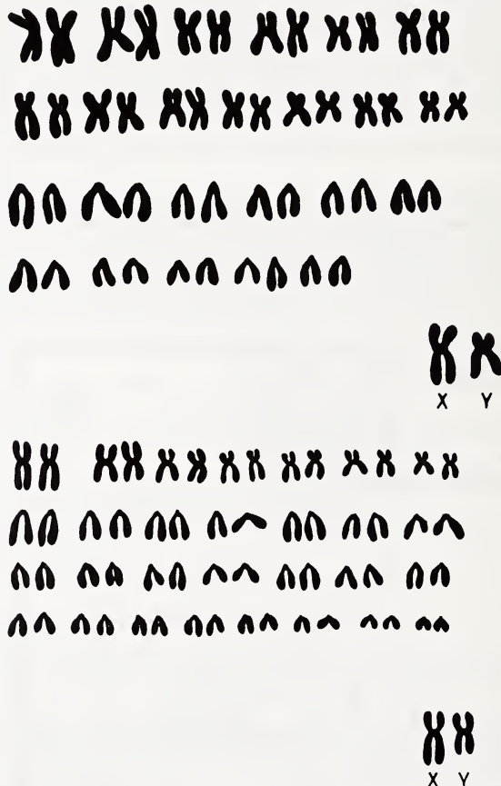
Fig. 3. Karyotype of a male M. meridianus , 2n = 50, FN = 78 (above) and a male M. crassus , 2n = 60, FN = 76 (below)