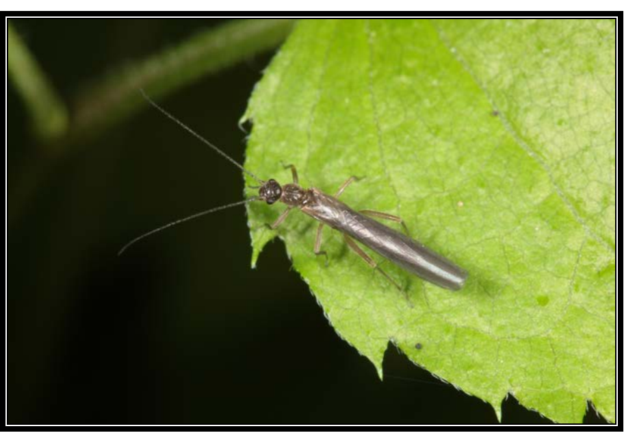
Leuctra sp. (Leuctridae) USA: Pennsylvania, Clinton County, Fishing Creek, 10 June 2013.