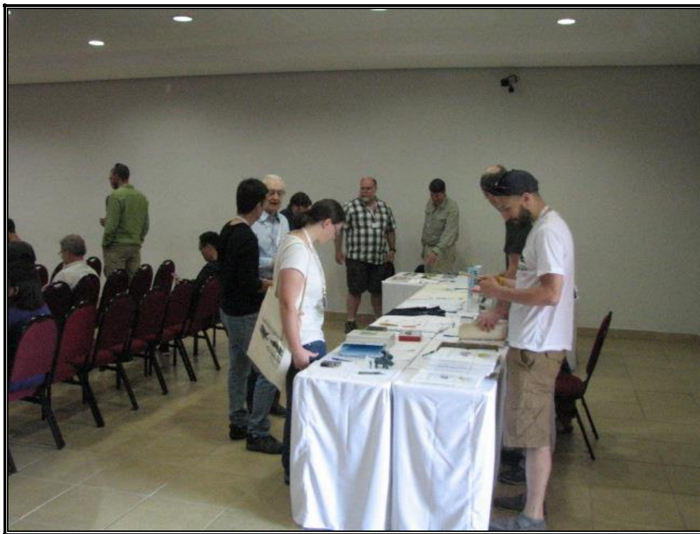
Checking the items available for the Silent Auction.