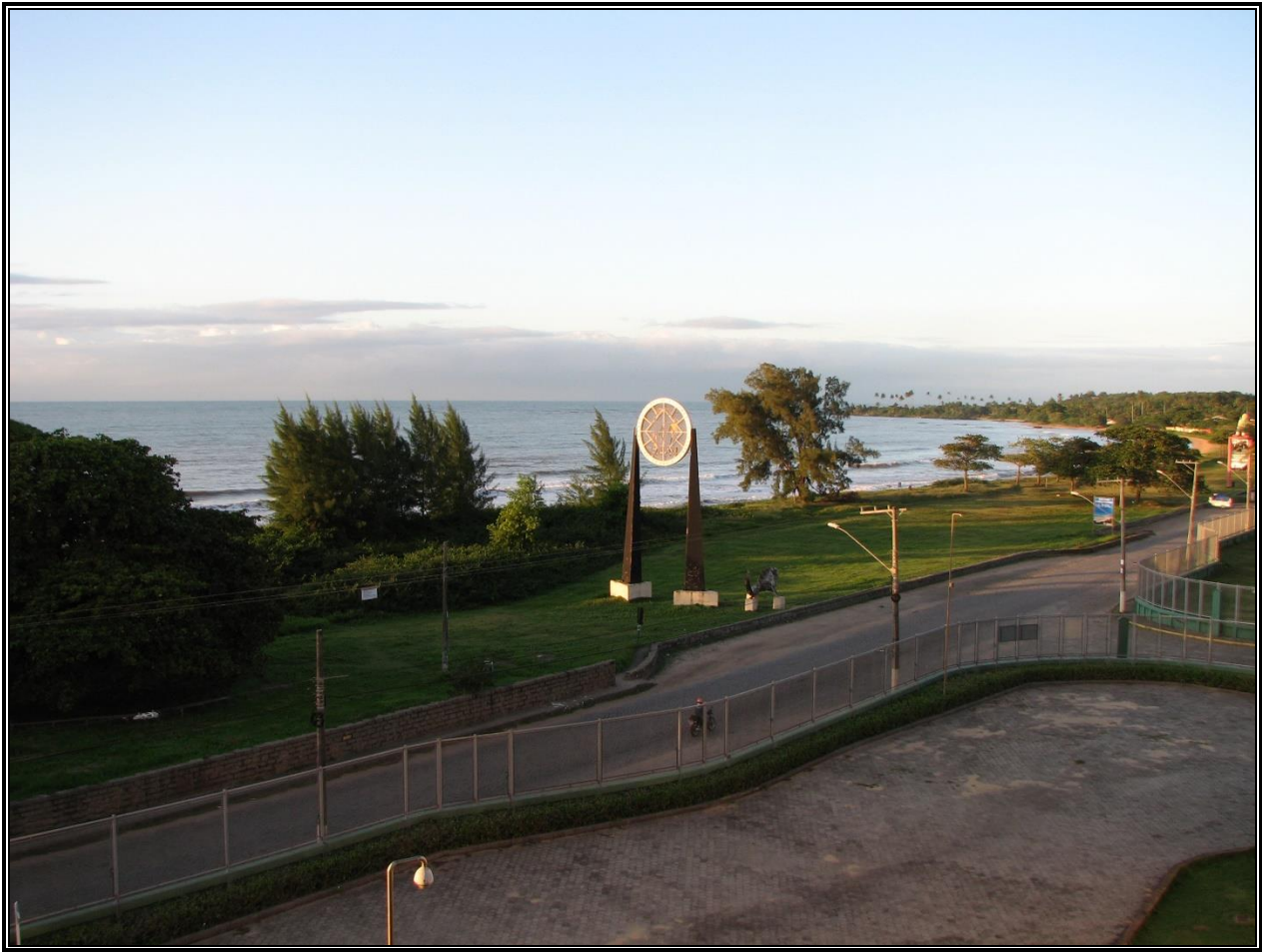
The view of the Atlantic Ocean from one of the dormitories.