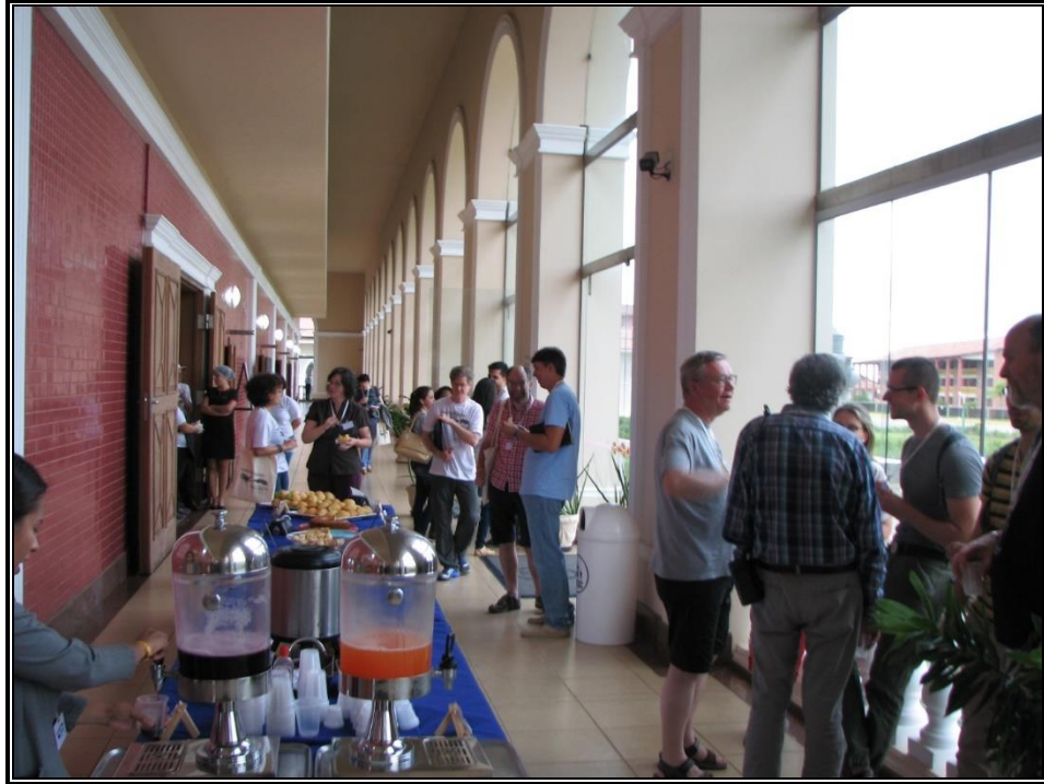
Session break in the spacious hallway of the Praia Formosa SESC Lodge.