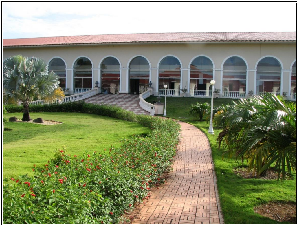
The meeting site of the conference, the Praia Formosa SESC Lodge.