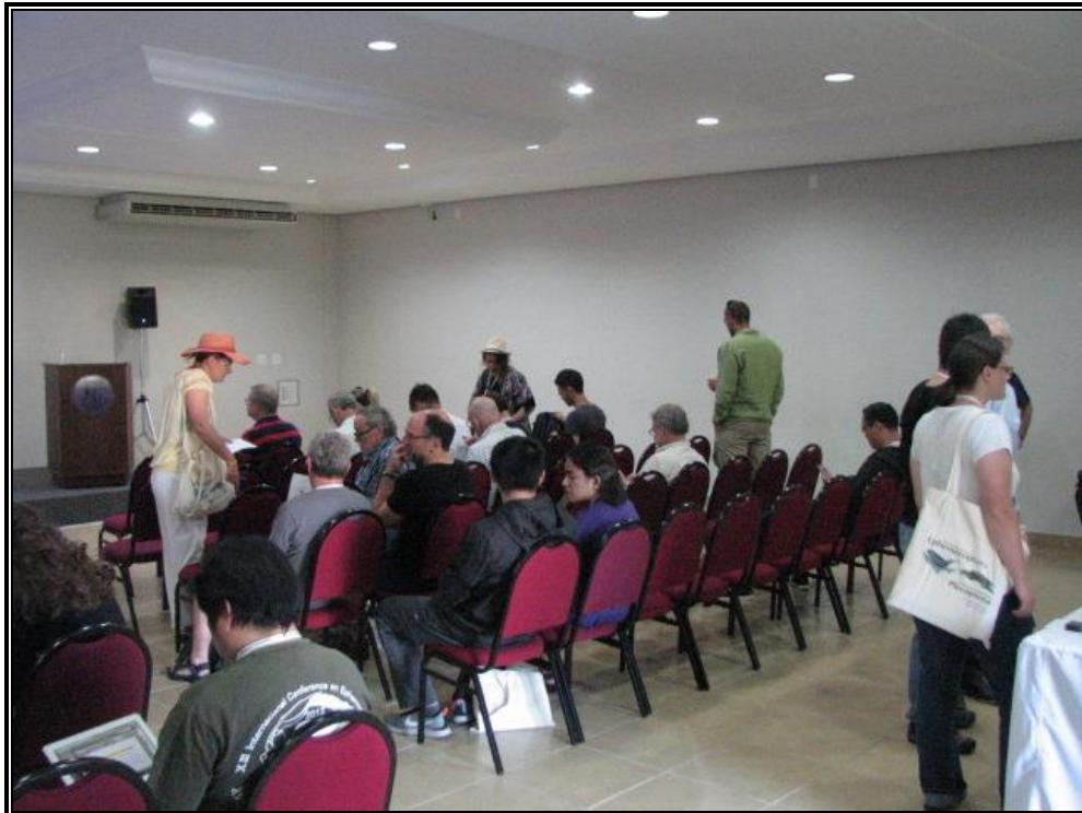
One of the meeting sessions.