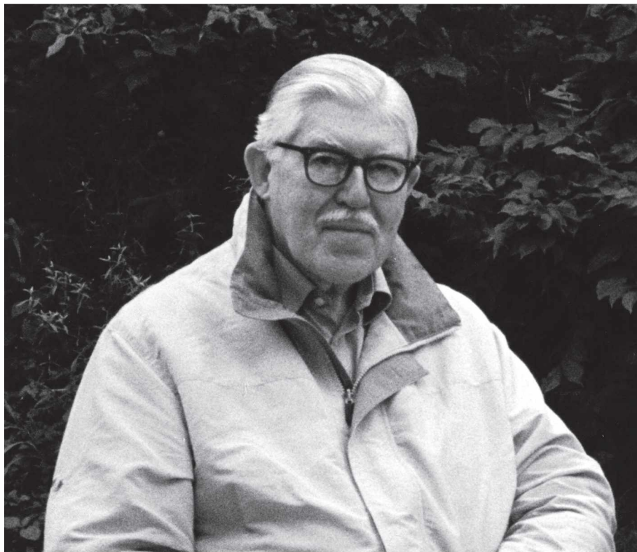
Fig. 5: Baker in Vienna (2002).