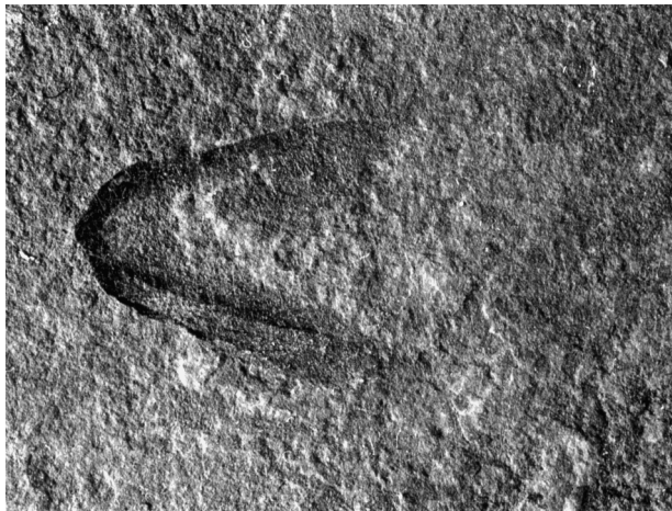
Text-fig. 1: Upper jaw of Placenticeratidae gen. et sp. indet. from the Late Cretaceous Tomaj limestone of Dobravljje, Slovenia. Collection B. JURKOVŠEK BJ 1533a. x 3.