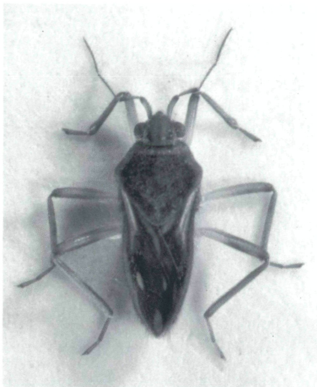
Fig. 1: Habitus of Microvelia somnokrene sp.n., ♂.

as in other Microvelia species, see Figures 18 - 20 (not apical as in Pseudovelie HOBBERLANDT, 1950); pygophore of both sexes small; parameres of male symmetrical, elongate, more or less reduced (Figs. 27 - 29); female with gonocoxae large, not covered by the small proctiger (Figs. 10 - 12).