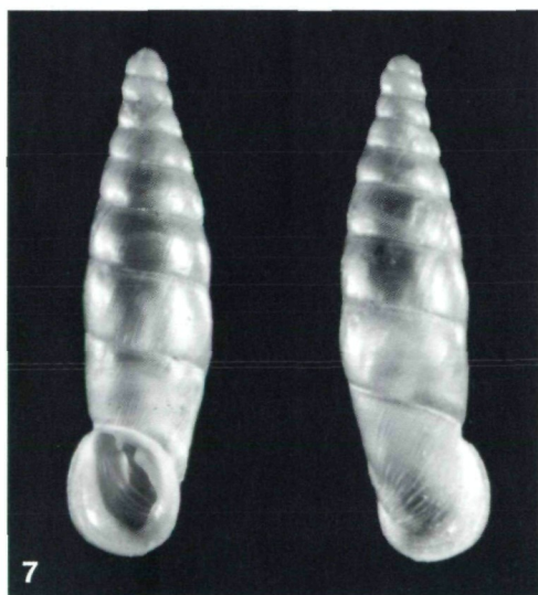
Figs 5-7: (5) Montenegrina helvola ornata ERÖSS & SZEKERES ssp.n., holotype NHMB 70838, 15.7 \times 3.3 mm; (6) Montenegrina irmen-gardis welterschultesi FEHÉR & SZEKERES ssp.n., holotype NHMB 70840, 22.1 \times 4.8 mm; (7) Isabellaria riedeli distanta SZEKERES ssp.n., holotype NHMB 70842, 15.6 \times 3.9 mm.

Description: The brownish horn-coloured shell of 9 to 9\frac{1}{3} whorls is almost entirely smooth, with fine ribs appearing over the apex. The aperture is relatively large, rounded, the peristome is gradually widening. From behind the peristome to the dorsal region the neck is covered by coarse, evenly spaced ribs. The basal crest is well developed, it lends an angular contour to the last whorl when seen from the front. The lamella superior is short, slightly S-shaped. The lamella inferior is positioned high in the aperture, in a perpendicular view it stands well apart from the lamella superior and the mostly hidden subcolumellaris. The lunella is lateral to ventrolateral. The dimensions of the shells are 15.5\text{--}16.3 \times 3.7\text{--}3.9 mm.