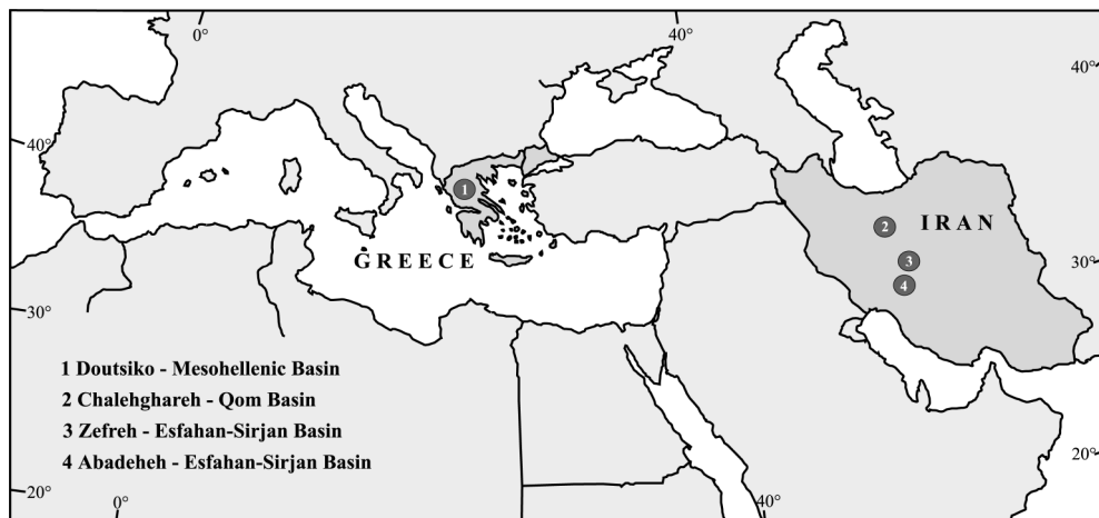
Fig. 1: Location of the investigated sections in Greece and Iran (map after STEININGER & al. in prep. modified).