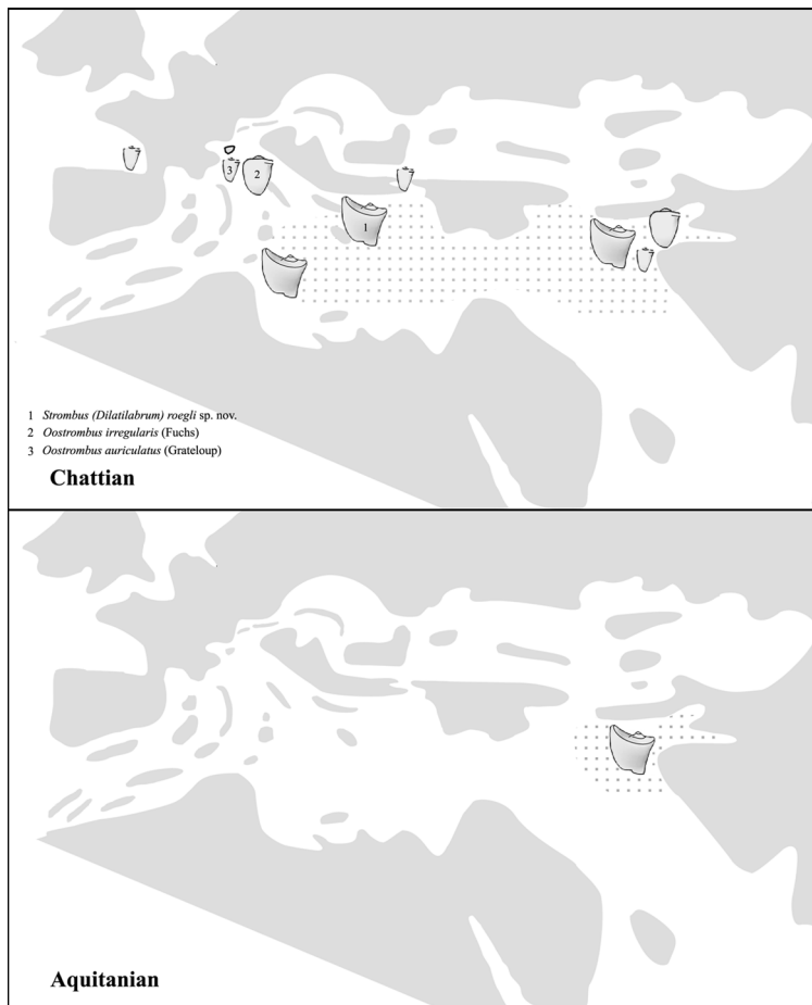
Fig. 2: Drastic reduction of distribution area of Strombus roegli from the Chattian to the Aquitanian. The "old-fashioned" Paleogene Oostrombus irregularis and Oostrombus auriculatus become extinct (in the investigation area) at least at the Oligocene/Miocene boundary. A distinct decrease in diversity of large-sized strombids can be observed. (Paleogeography based on Aquitanian-map after RÖGL 1998, modified)

fortisi BRONGN. from the Middle Eocene of N-Italy is very similar in wing structure, the deflected canal and the bulgy sutural shelf formed by the latest adult whorls (compare Strombus (D.) fortisi in SAVAZZI 1991: 322, BENEVENTI & PICCOLI 1969: pl. 1, WENZ 1940: 945, COSSMANN 1904: pl. 1). The main differences are only the smaller size and the absent stromboid notch. Consequently, Strombus roegli seems to unite features of the extinct subgenus Dilatilabrum with those of the extant Tricornis . Significantly, ABBOTT (1960) suggested Strombus trigonus GRAT. which is placed within Dilatilabrum , to be a forerunner of the Tricornis group. In contrast, SAVAZZI (pers. comm.) suggested that the development of the stromboid notch may have developed twice. The contemporaneous Strombus radix - representing the ancestor-group of the modern Strombus lineage - already shows a distinct stromboid notch. Therefore, the Dilatilabrum group seems to