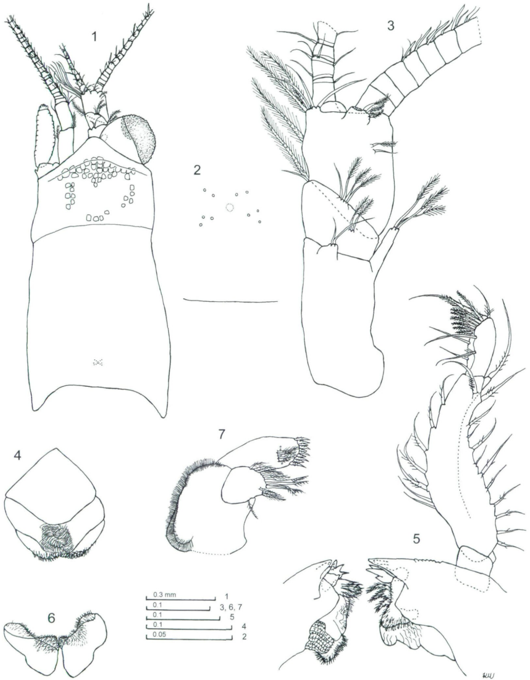
Figs. 1-7: Heteromysis arianii sp.n. (1: holotype ♂ 2.9 mm; 2, 5, 7: paratype ♂ 2.8 mm; 3, 4, 6: paratype, subadult ♀ 4.0 mm): (1) anterior body region of male, (2) pores in front of posterior margin of carapace, (3) right antennula of female, dorsal, (4) labrum, oblique ventral view, (5) mandibles with left palpus, caudal aspect, (6) labium, (7) maxillula, caudal aspect.