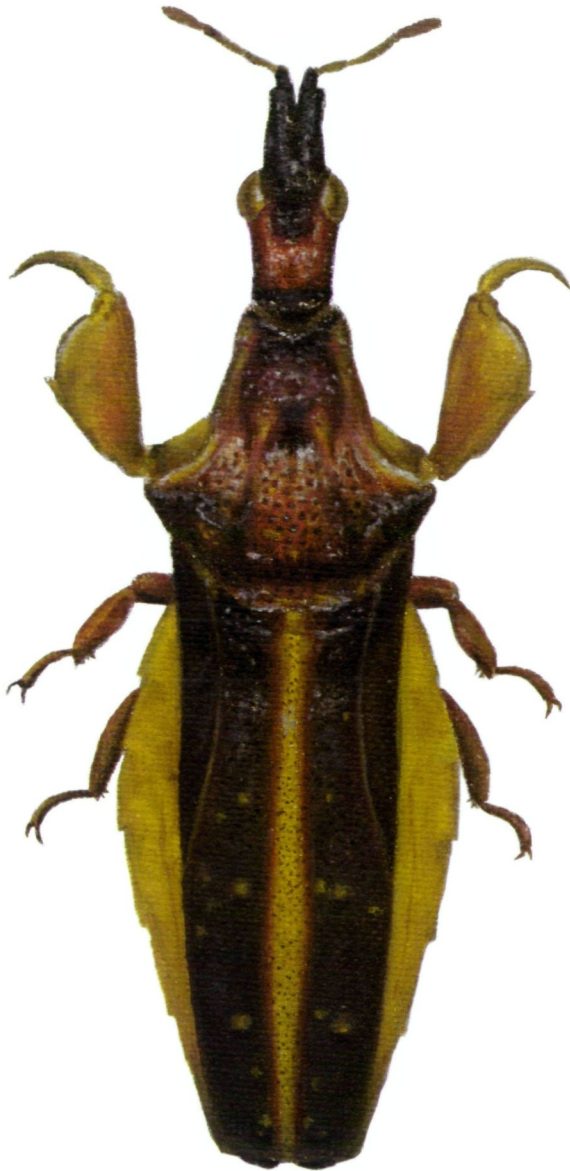
Fig. 1: Glossopelta laotica sp.n., female habitus, dorsal aspect (illustration: M. Buch).