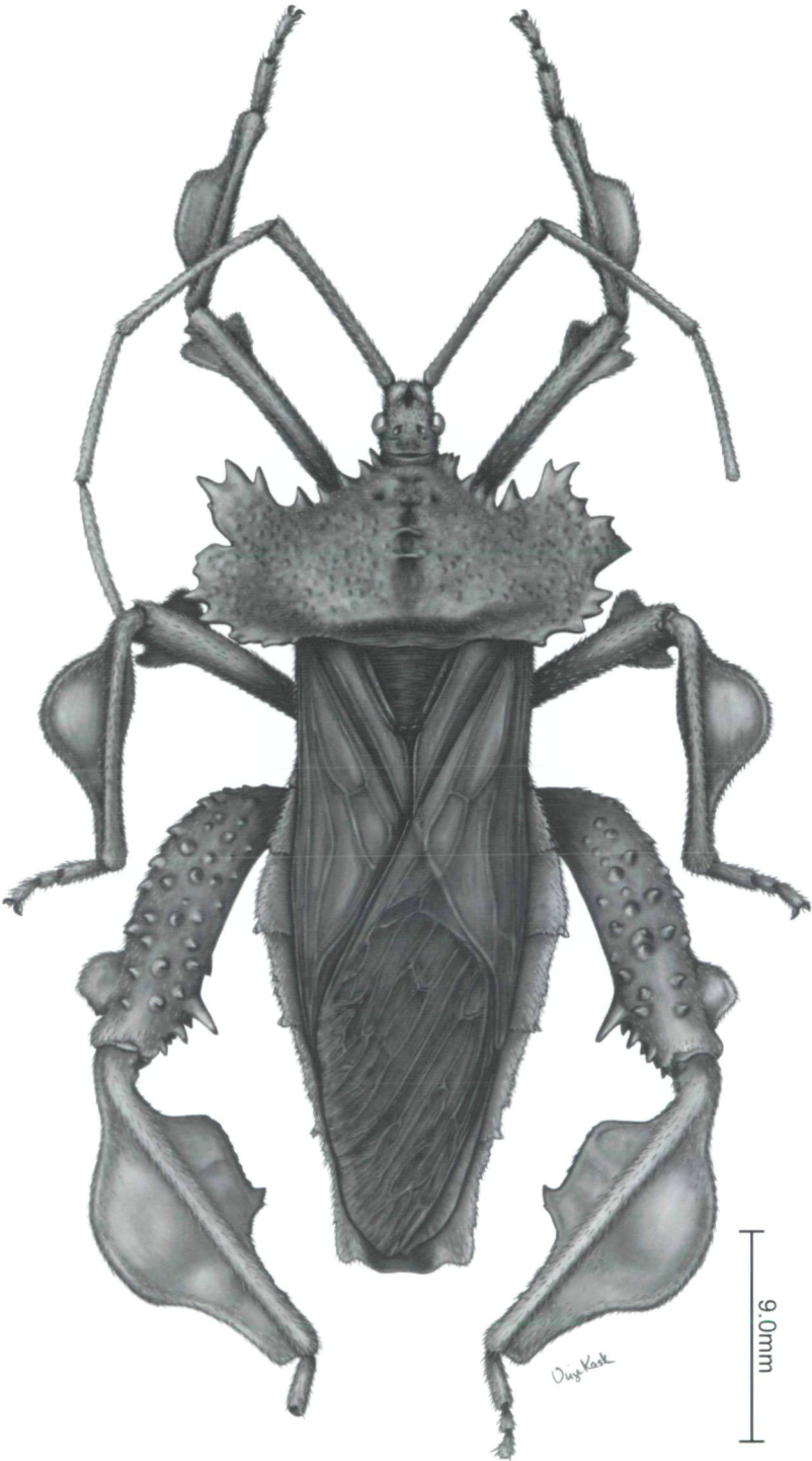
Fig. 1: Helcomeria osheai , holotype, male.