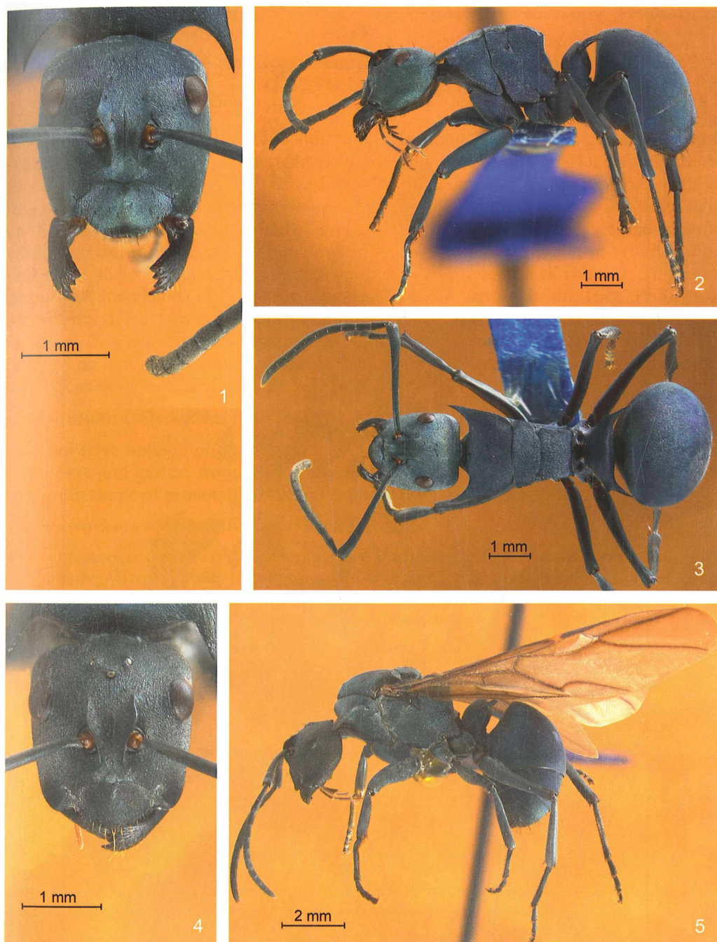
Figs. 1–5: (1–3) Polyrhachis baca sp.n. (holotype worker): (1) head, frontal view; (2) lateral view; (3) dorsal view. (4–5) Polyrhachis sp. A from Hikdop Island (gyne): (4) head, frontal view; (5) lateral view.