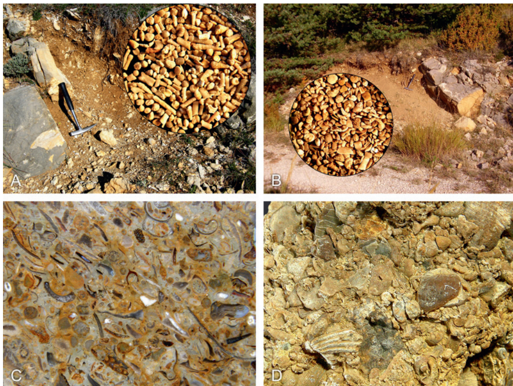
Fig. 2. A: locality 1 and associated microfauna; B: locality 2 and associated microfauna; C: polished section from the bed exposed at locality 1 (width of image: 60 mm); D: weathered surface of the bed at section 2 (width of image: 40 mm).

The horizons exposed at localities 1 and 2 are highly fossiliferous and very similar in composition, although particle size differs between the horizons, that of locality 2 being slightly larger in average. Locality 3, in contrast, delivered mainly belemnites.