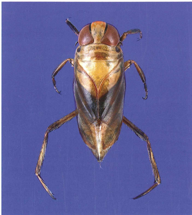
Fig. 1: Habitus, dorsal aspect, of Enithares unguistigris sp.n., male paratype.