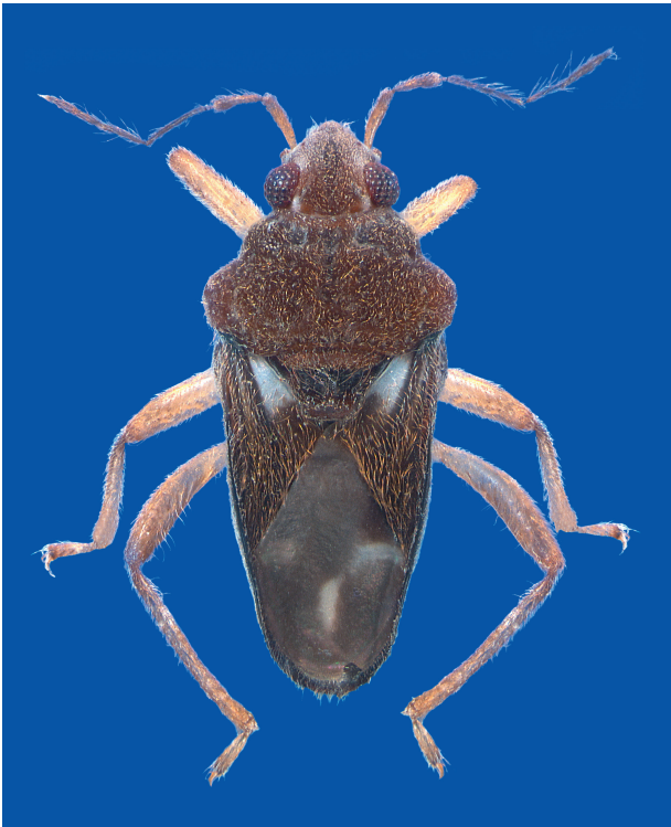
Fig. 1: Habitus of Hebrus vietnamensis sp.n.