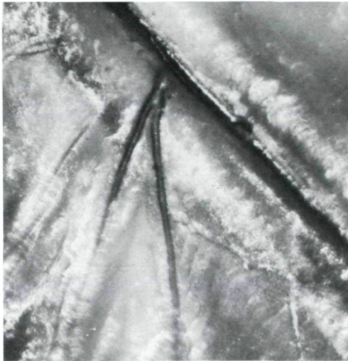
Fig. 2: Common stem of the cubital veins in Mindarus paratransparens n. sp.

Body 2.15 mm long. Head width across the eyes about 0.75 mm. Compound eyes large. Triommatidion present but poorly visible. Ocelli not discernible. Antennae 6-segmented. Total length of the antenna 0.90 mm, the other antenna and secondary rhinaria invisible. Antennal segment lengths in mm: III – 0.34; IV – 0.12; V – 0.12; VI – 0.17 (0.11 + 0.06). Rostrum reaching slightly beyond hind coxae, 1.39 mm in total length. Forewing: length 3.28 mm, width 1.1 mm (Fig. 1).