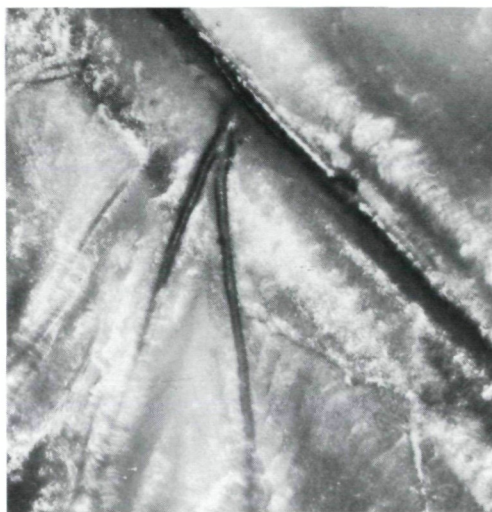
Fig. 2: Common stem of the cubital veins in Mindarus paratransparens n. sp.

Body 2.15 mm long. Head width across the eyes about 0.75 mm. Compound eyes large. Triommatidion present but poorly visible. Ocelli not discernible. Antennae 6-segmented. Total length of the antenna 0.90 mm, the other antenna and secondary rhinaria invisible. Antennal segment lengths in mm: III – 0.34; IV – 0.12; V – 0.12; VI – 0.17 (0.11 + 0.06). Rostrum reaching slightly beyond hind coxae, 1.39 mm in total length. Forewing: length 3.28 mm, width 1.1 mm (Fig. 1).