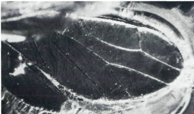
Fig. 3: The forewing of Mindarus magnus with an additional vein between pterostigma and radial sector.

Body length 2.10 mm. Frons slightly protruding. Compound eye strongly protruding with a distally located triommatidion. Antennae 6-segmented, 0.9 mm long with 12 secondary rhinaria; secondary rhinaria transversely oval in shape and located along the entire length of antennal segment III. Lengths of antennal